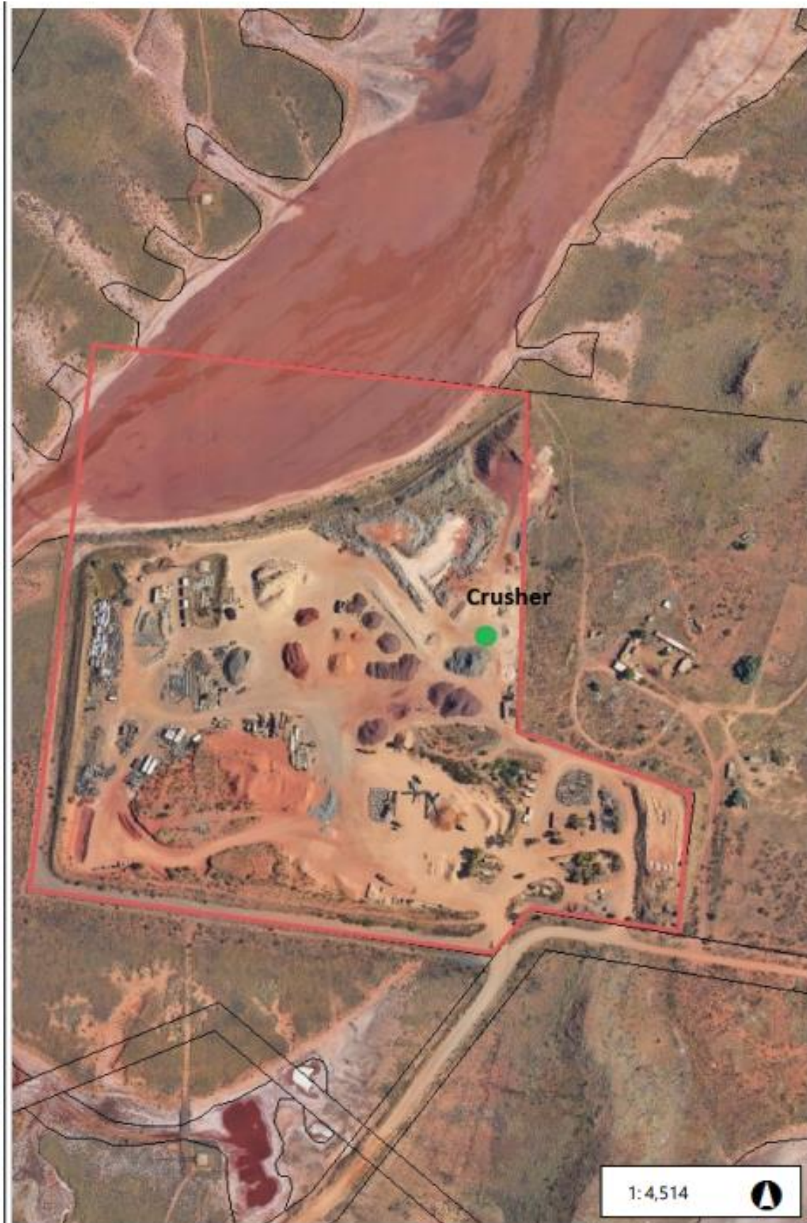
Figure 2: Crusher Location

L9136/2018/1 Amendment Date: 21 February 2025