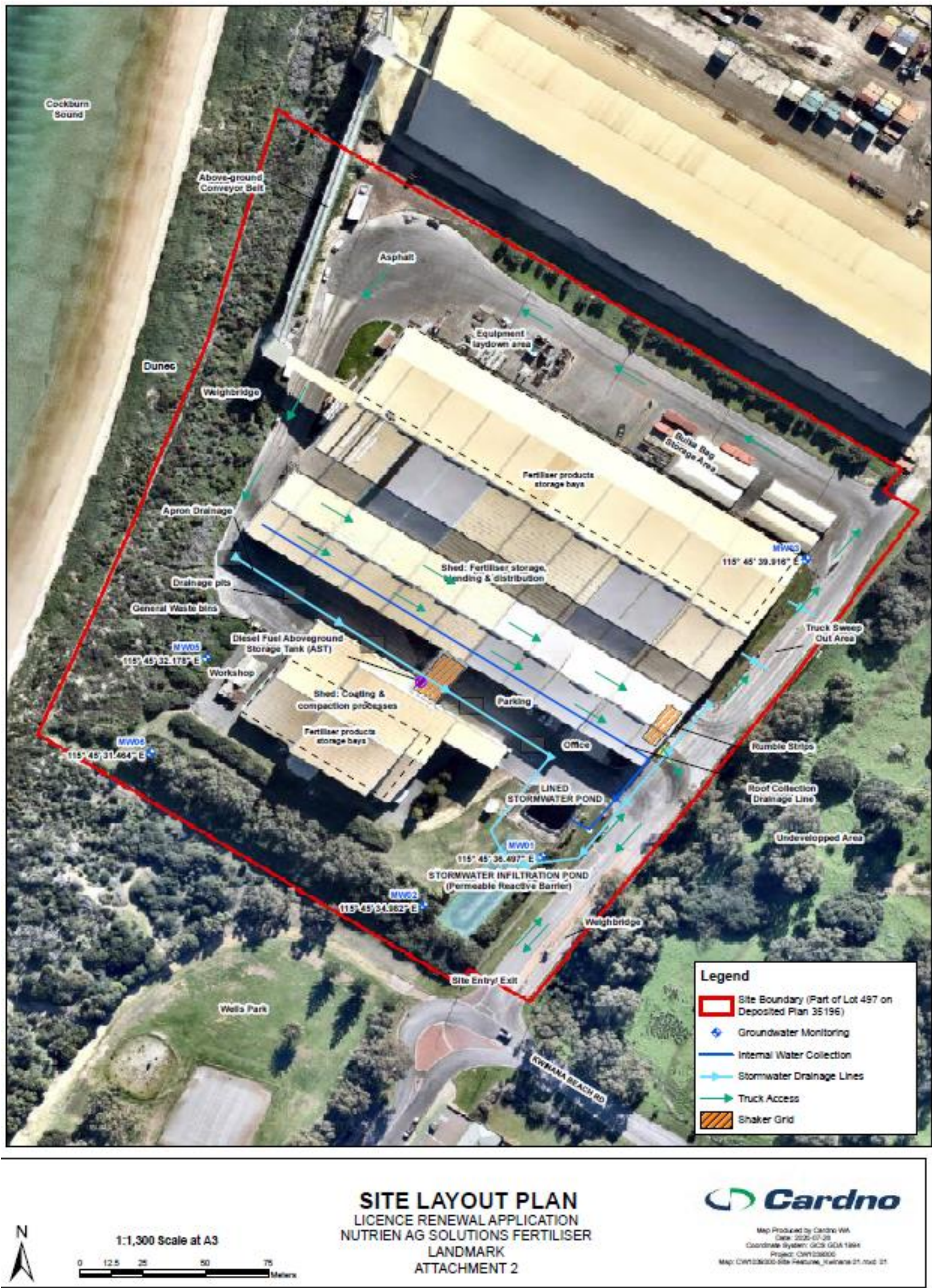
Figure 2: Site layout of the prescribed premises

The layout of the prescribed premises is shown in the map below (Figure 1).