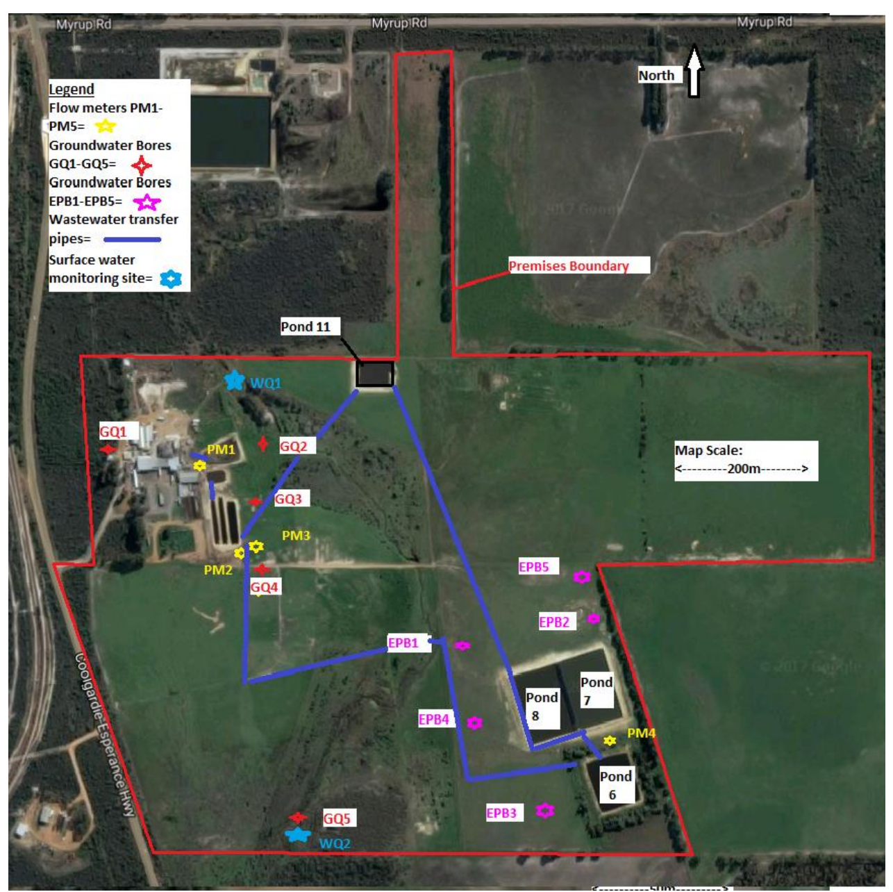
15 March 2017

The locations of the monitoring points defined in Tables 3.4.1, 3.5.1 and 3.5.2 are shown below. The location of containment infrastructure defined in Table 1.3.2 is shown below.