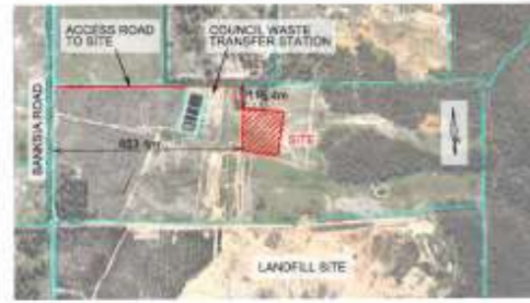
LOCALITY PLAN: N.T.S.