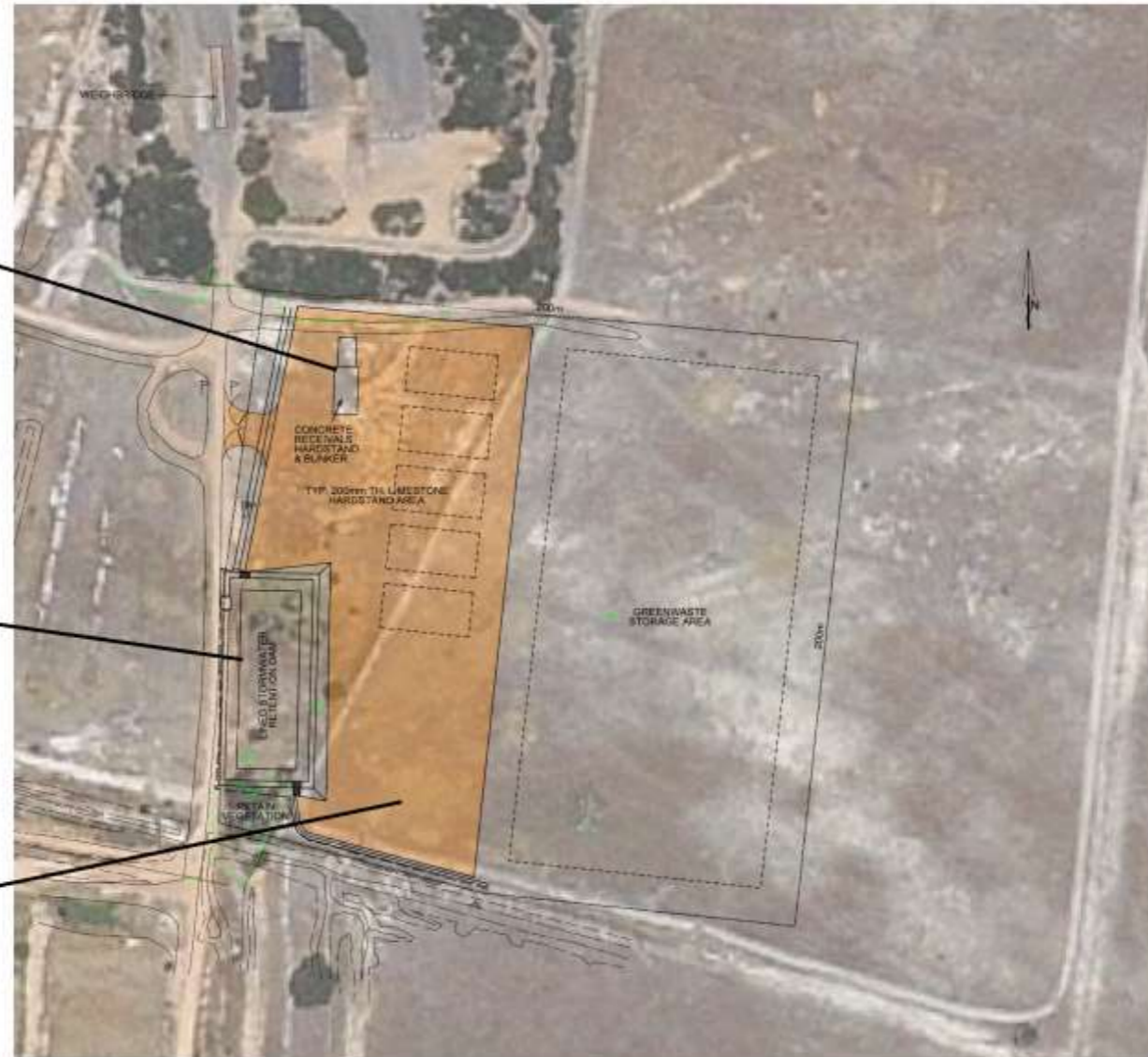
SITE GENERAL LAYOUT SCALE 1:1,000