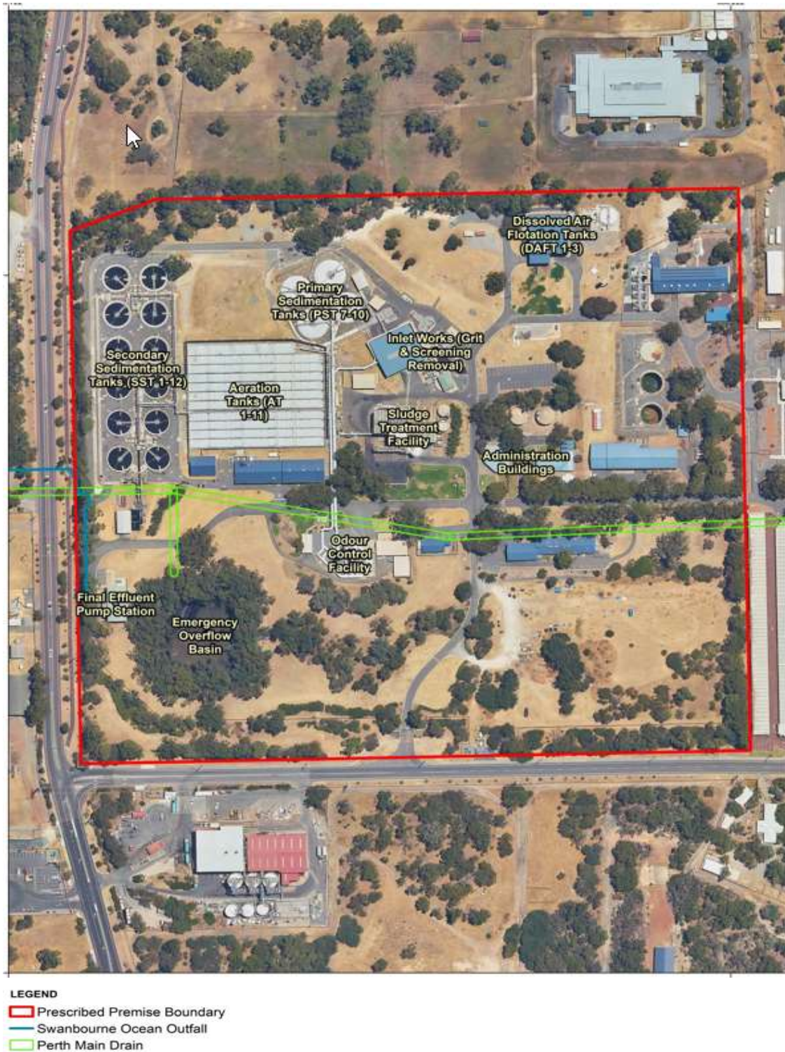
Figure 1: Map of the boundary of the prescribed premises and infrastructure and site layout.

The boundary of the prescribed premises and infrastructure and site layout is shown in the map below (Figure 1).