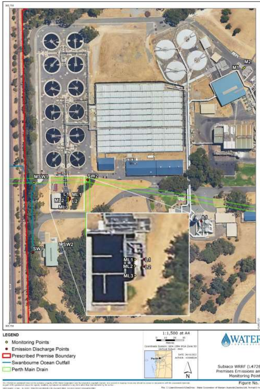
Figure 3: Premises emissions points (A1, SW1, SW2, L1 and L2) and monitoring points (MSW1, MSW2, ML1, ML2, ML3, M1 and M2).

The premises emission and monitoring points are shown in the map below (Figure 3).