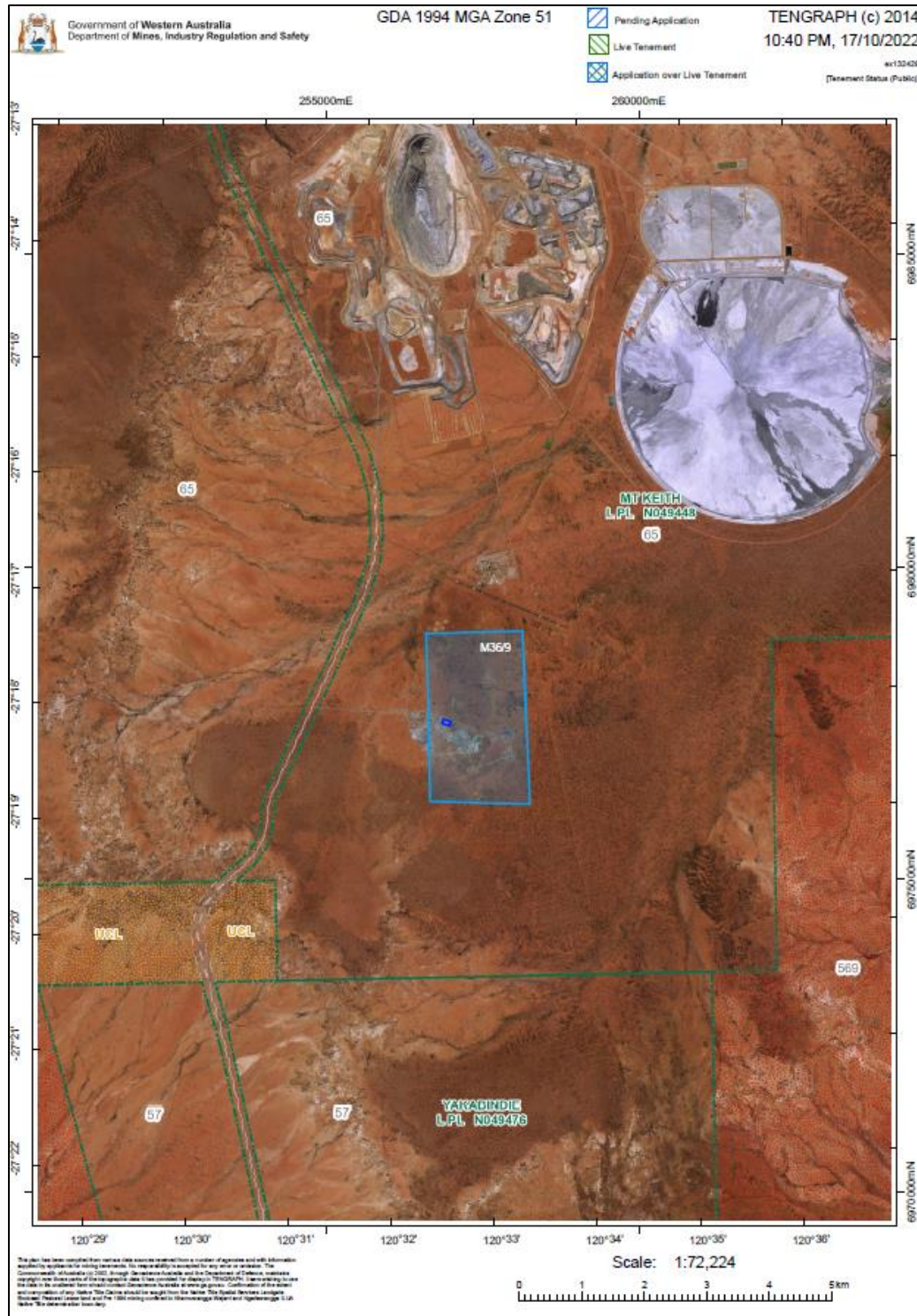
Figure 1: Map of the boundary of the prescribed premises outlined in light blue. Concrete batching process area outlined in dark blue.

The boundary of the prescribed premises is shown in the map below (Figure 1).