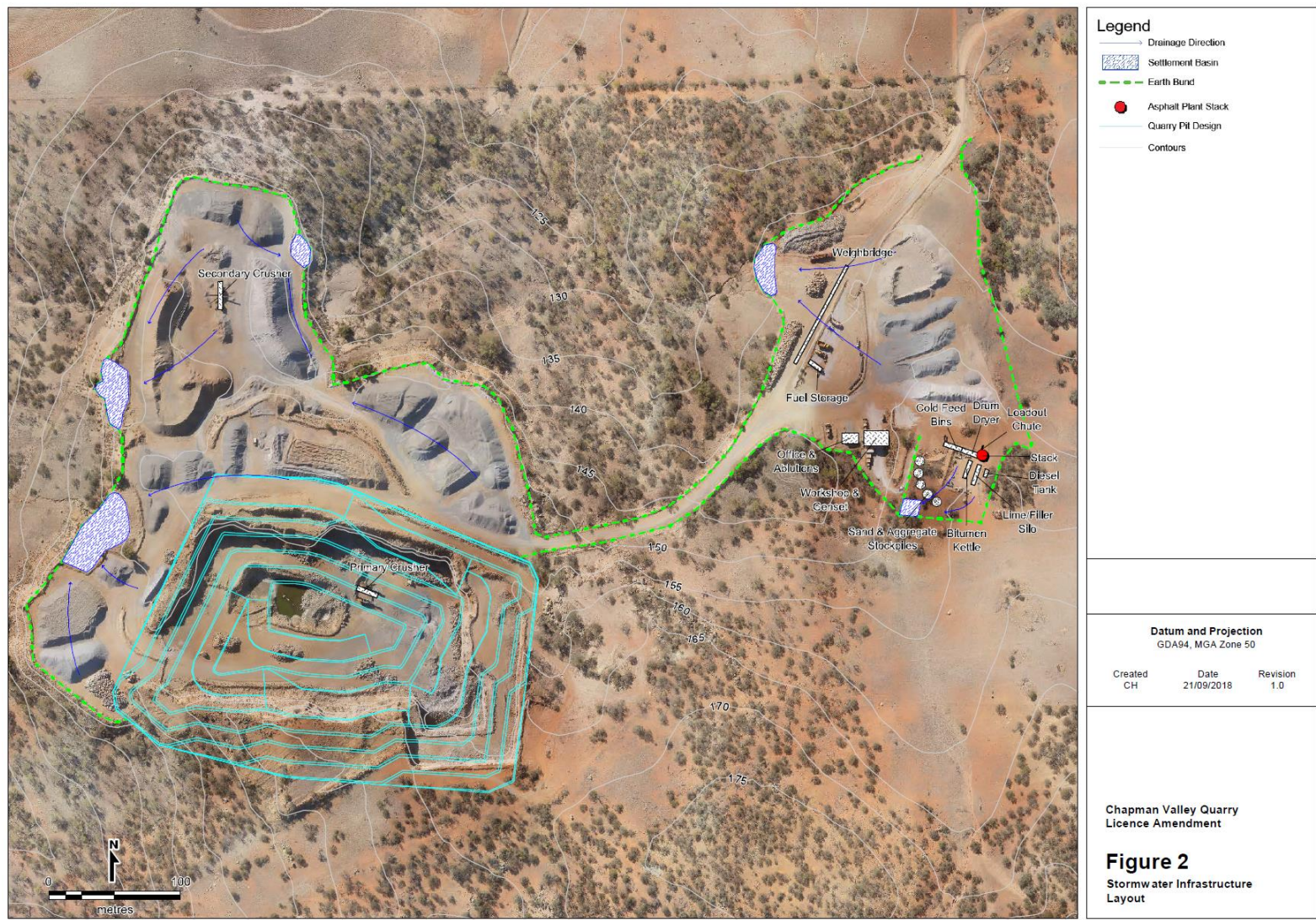
Figure 2: Site layout

The site layout is shown below in Figure 2.