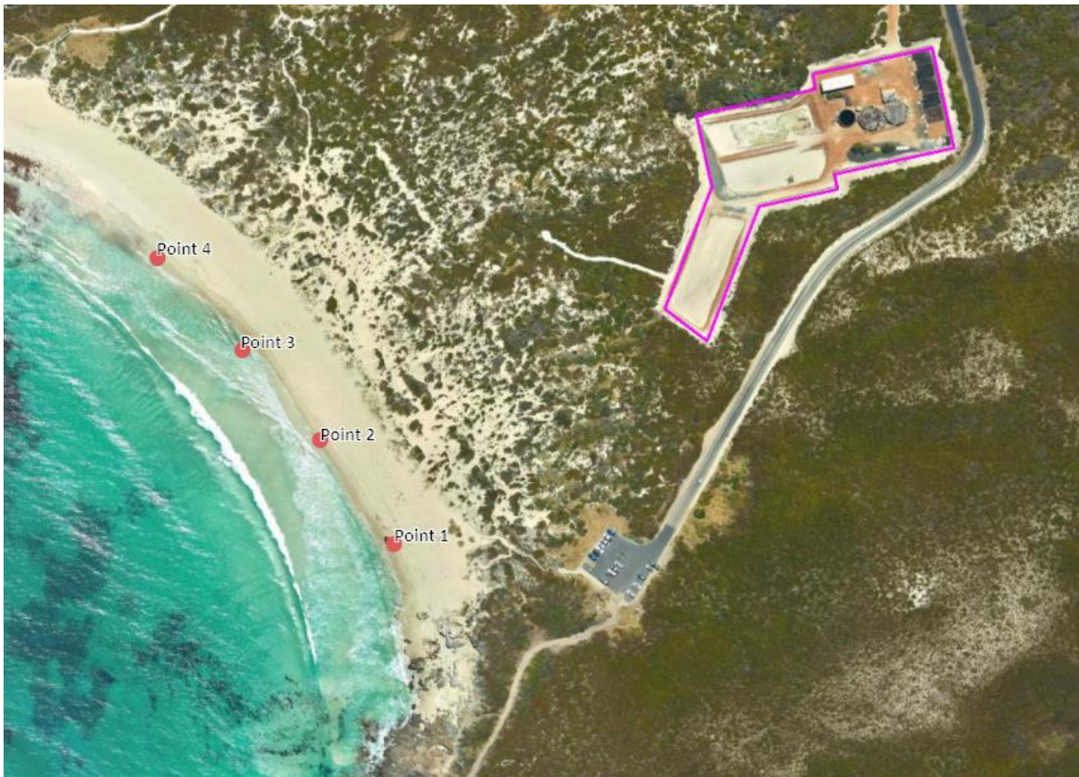
Figure 2: Shore sample points

The location of shore sample points is shown by the red circles in the map below (Figure 2).