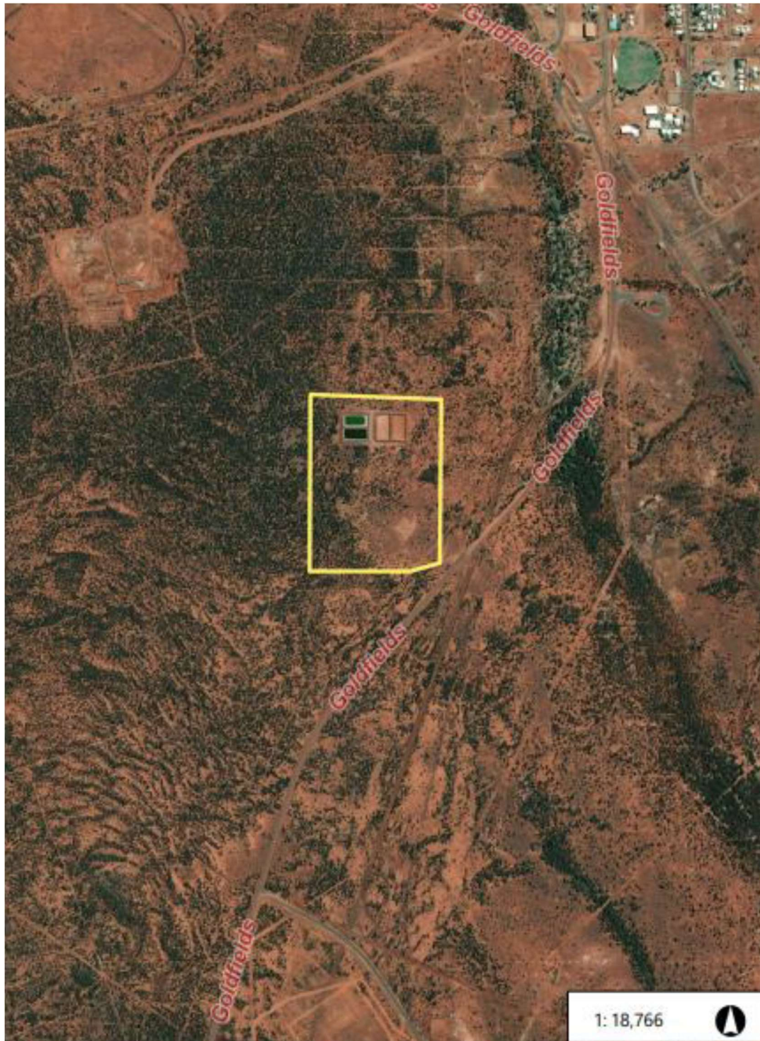
Figure 1: Map of the boundary of the prescribed premises

The boundary of the prescribed premises is shown in the map below (Figure 1).