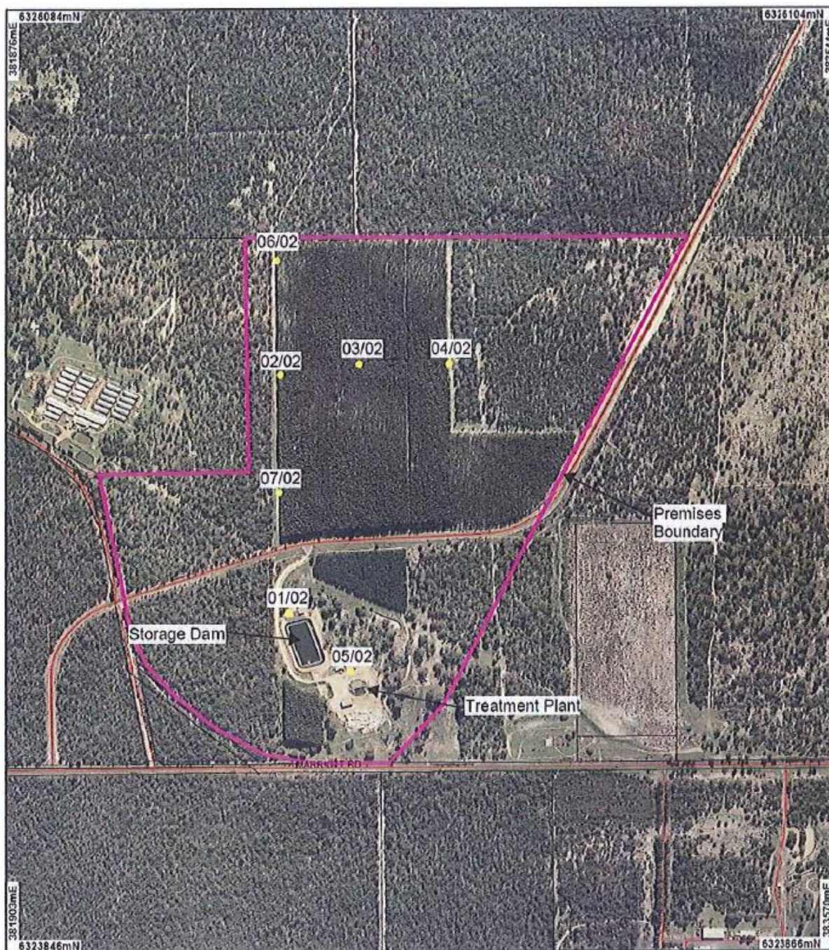
Figure 3: Map of the monitoring bores

The locations of monitoring bores are represented in the map below (Figure 3).