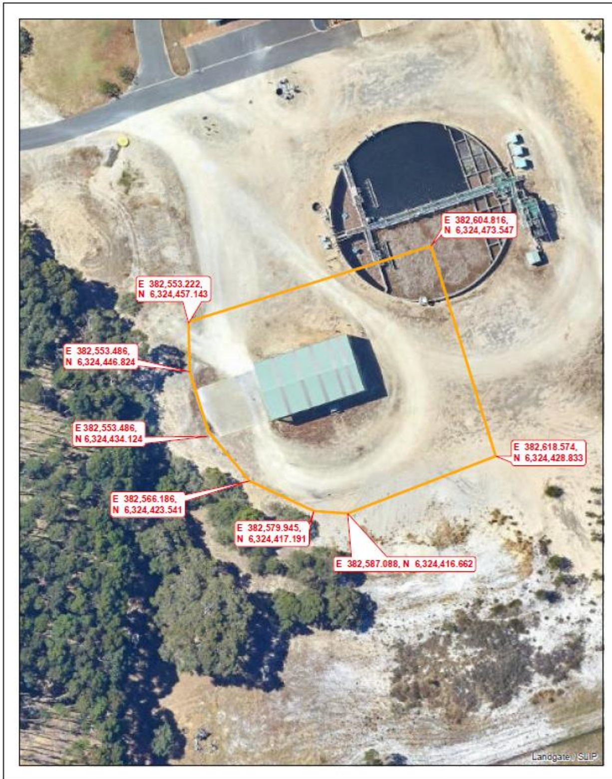
Figure 2: Map of the STP development footprint

The boundary of STP Development Footprint is shown as light brown in the map below (Figure 2).