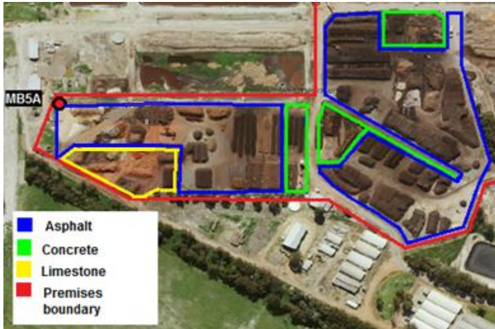
Figure 3: Hardstand materials

The areas of asphalt, concrete and compacted limestone hardstand are shown in the map below.