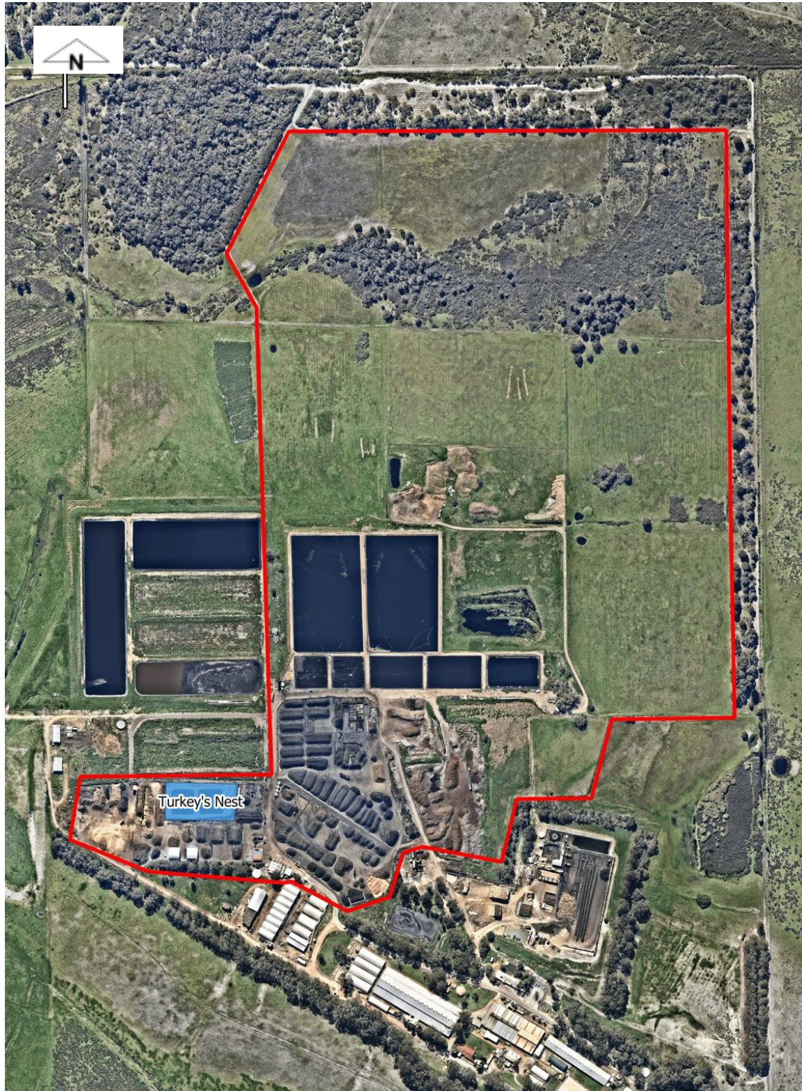
Figure 1: Premises boundary

The Premises is shown in the map below. The red line depicts the boundary of the Premises.