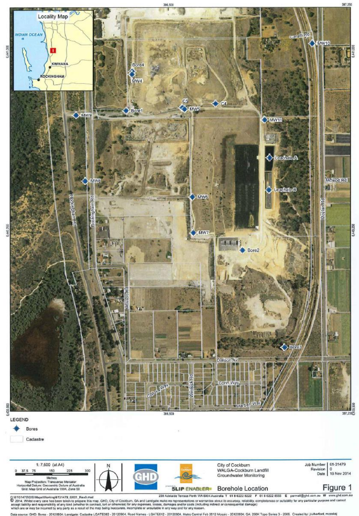
Figure 2: Monitoring locations

The locations of the monitoring points defined in Tables 3.7.1 and 3.8.1 are shown below.