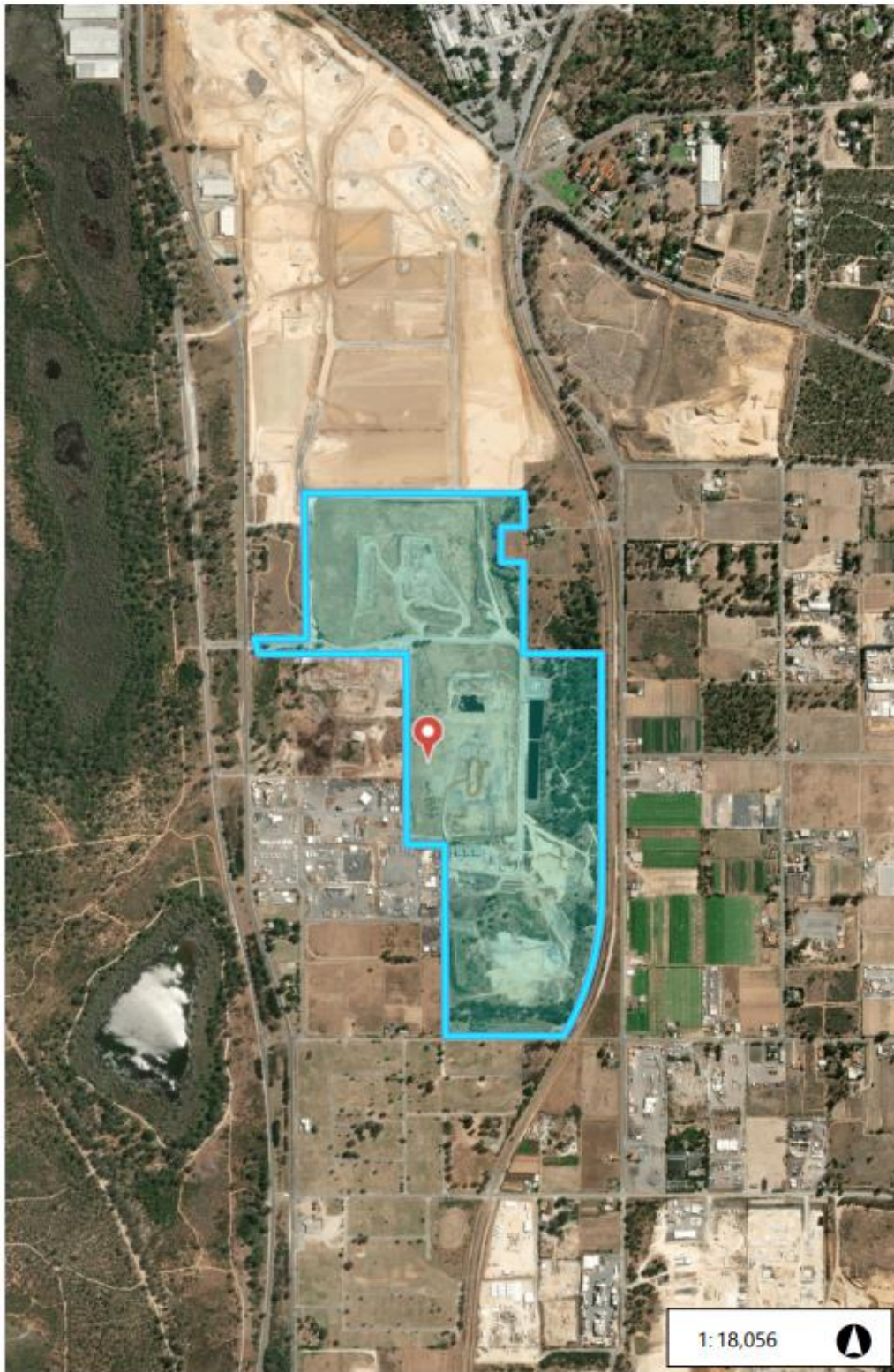
Figure 1: Prescribed premises boundary

The Premises is shown in the map below. The blue line depicts the Premises boundary.