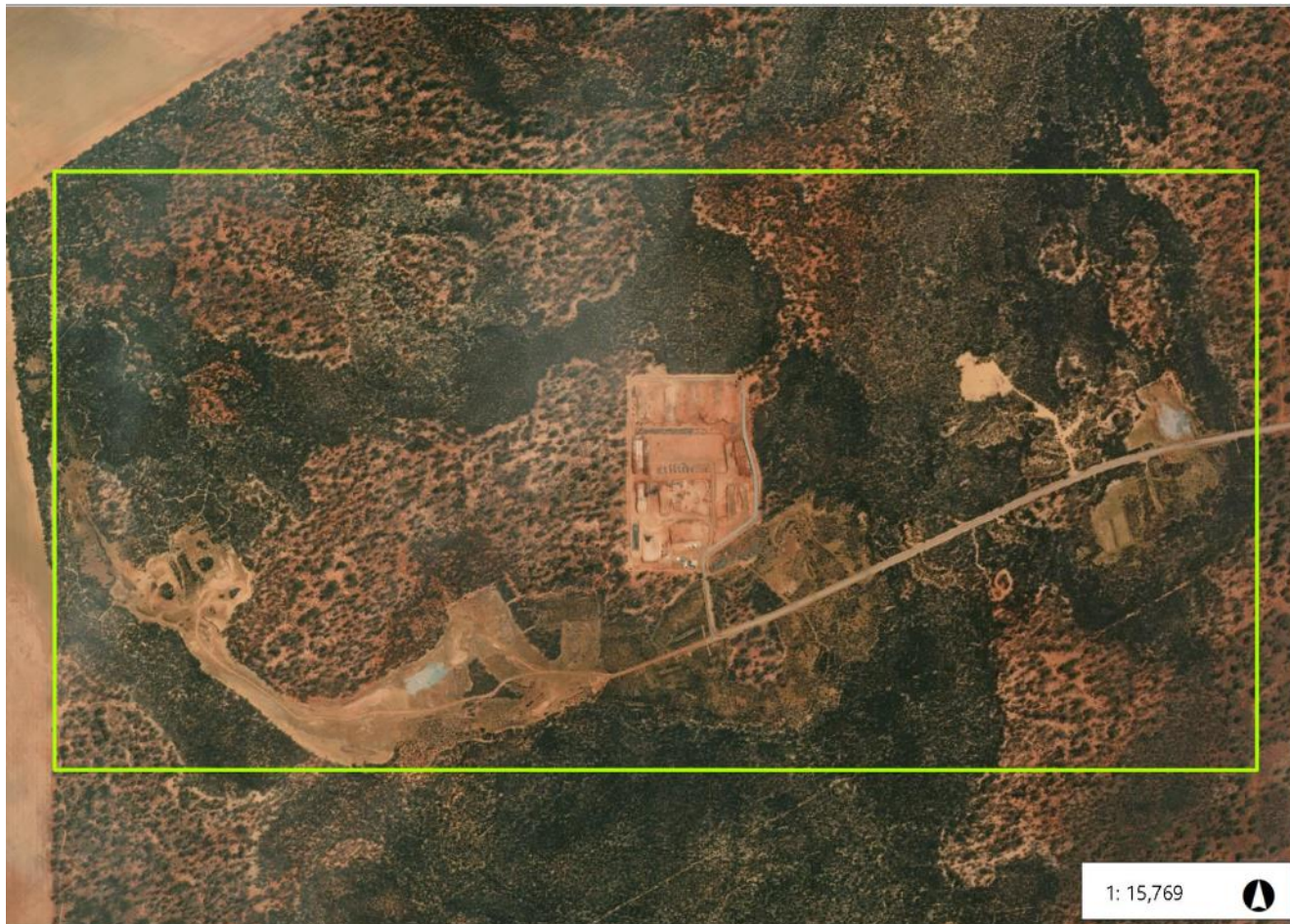
Figure 1: Map of the boundary of the prescribed premises

The boundary of the prescribed premises is shown in the map below (Figure 1).