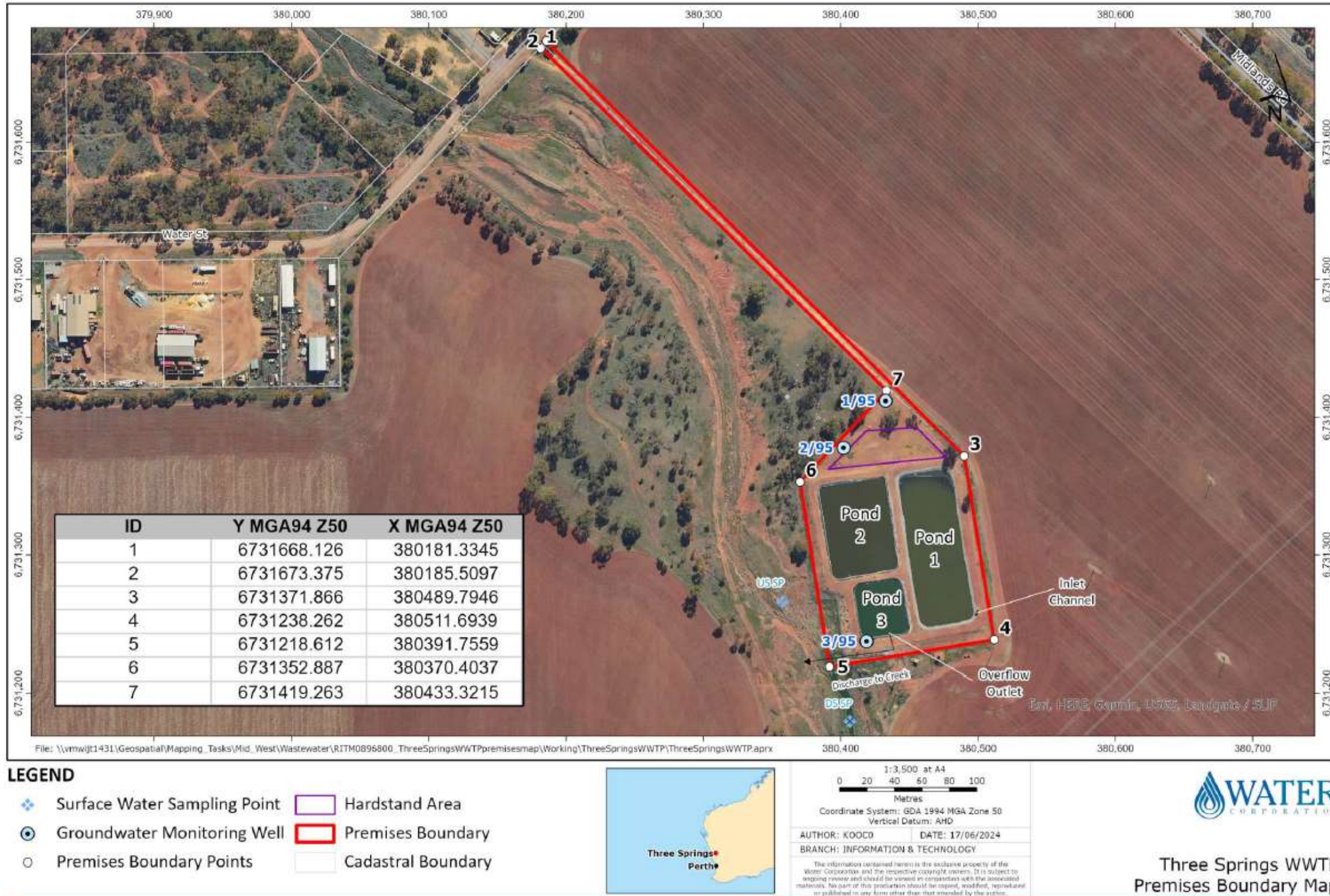
Figure 1: Map of the boundary of the prescribed premises.

The boundary of the prescribed premises is shown in the map below (Figure 1).