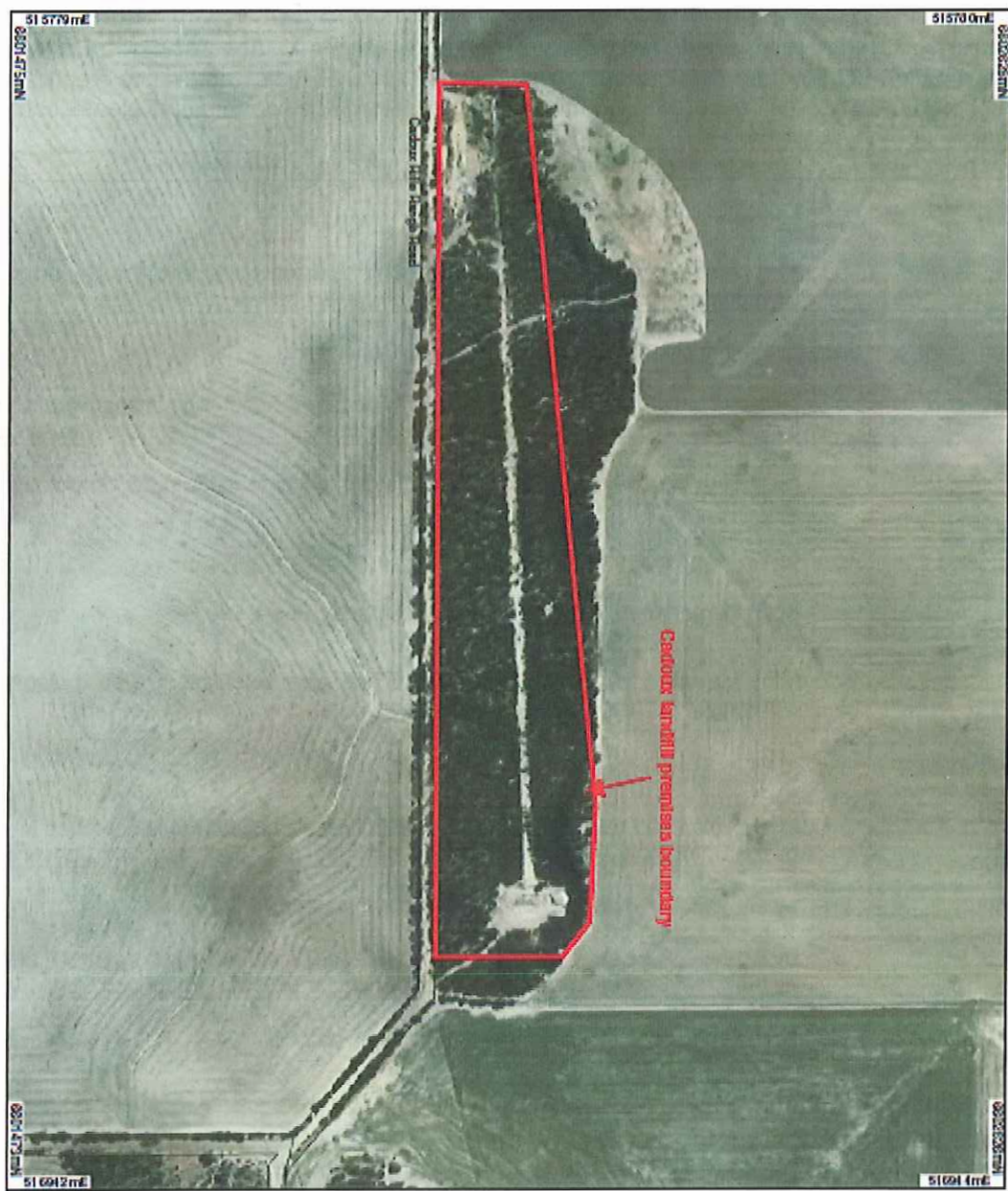
Cadoux Landfill Site