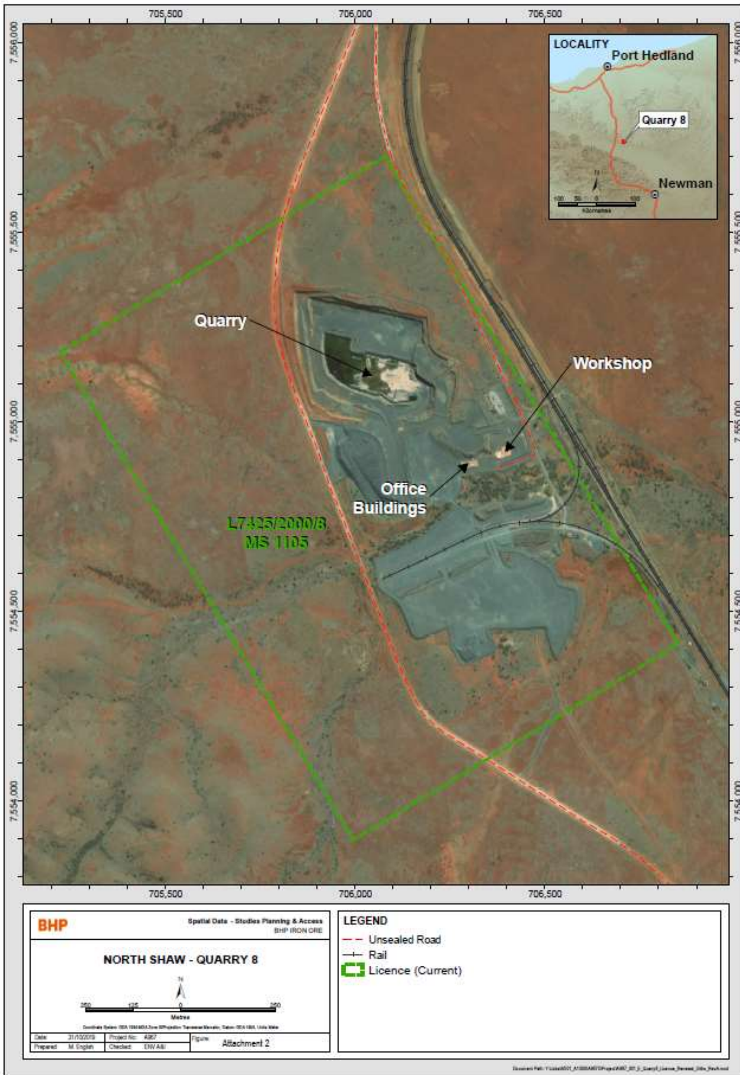
Figure 2 Map of prescribed premises