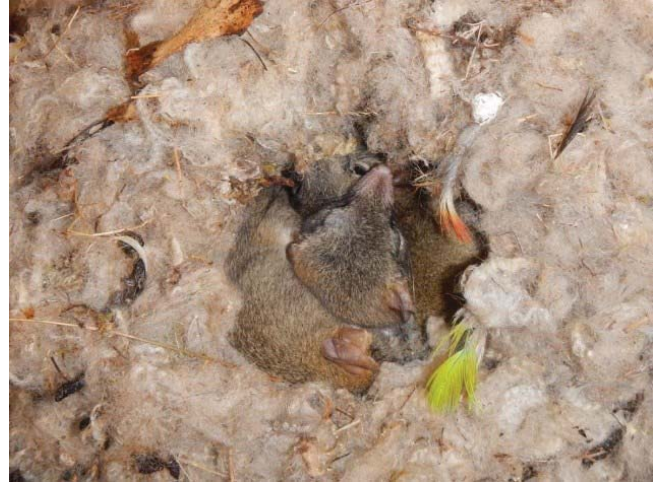
Red-tailed phascogales inside a nest box.

It is important to continue a regime of regular maintenance while the nest box is required.