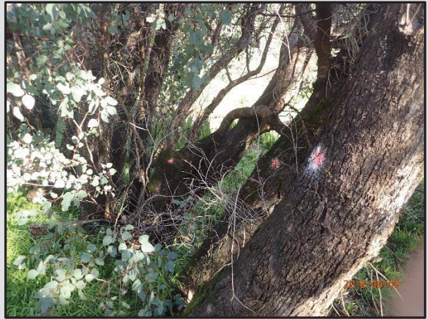
Photo 1: Riparian vegetation (Eucalyptus rudis) in the application area