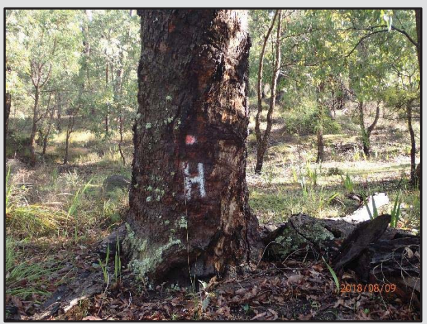
Photos 2: Habitat tree (containing a hollow suitable for black cockatoos; circled red in Figure 1) which has been removed from the application area, also showing the degraded understorey dominated by paddock grasses