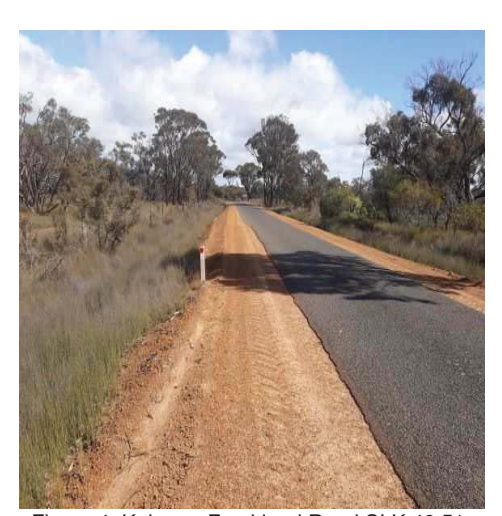
Figure 4: Kojonup-Frankland Road SLK 40.51, facing south (Shire of Kojonup, 2018b)