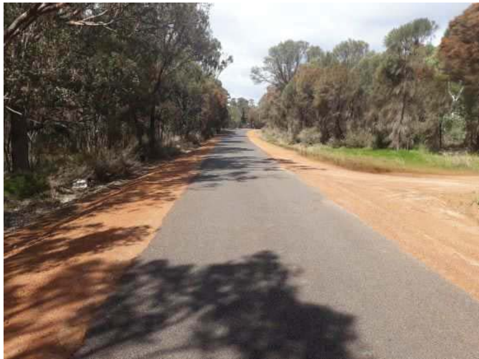
Figure 2: Kojonup-Frankland Road SLK 43.86, facing south (Shire of Kojonup, 2018b)