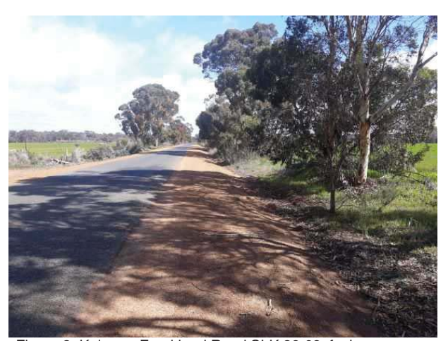
Figure 3: Kojonup-Frankland Road SLK 39.68, facing south (Shire of Kojonup, 2018b)