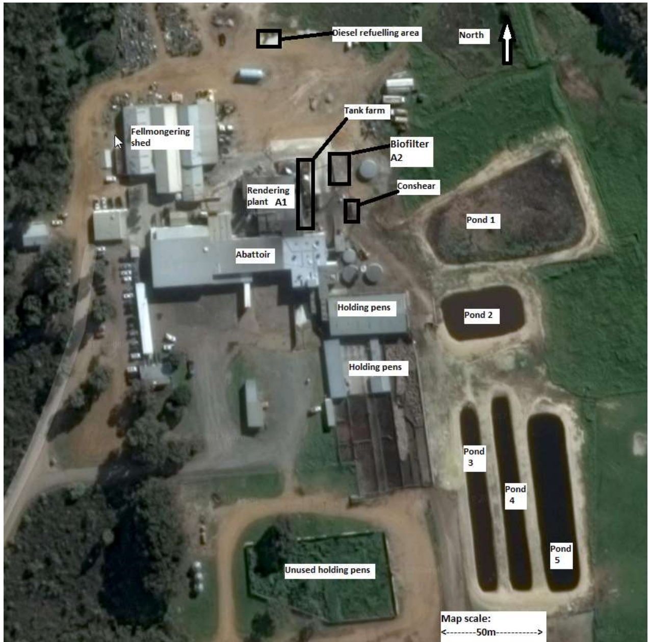
Photo Source: Google Earth http://google.com.au/maps/ 15 March 2017

The locations of the emission points defined in Tables 2.2.1 and 3.2.1 are shown below. The location of containment infrastructure defined in Table 1.3.2 is shown below.