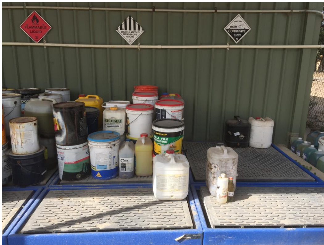
Photo 2: Example of Hazardous Liquids, including Paint, Stored on a Bunded Pallet