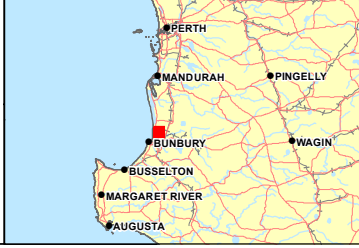
Figure 4 Map of Key Infrastructure for Train 1 and Common Facilities