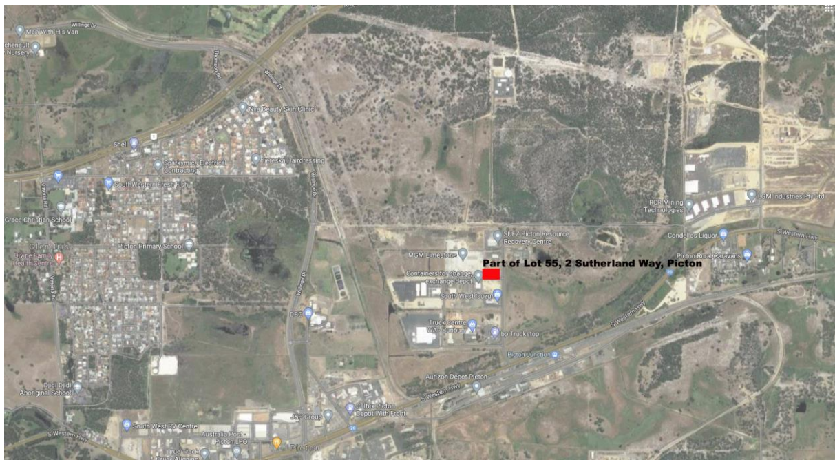
Figure OD4 Surrounding Lots at the Picton Site