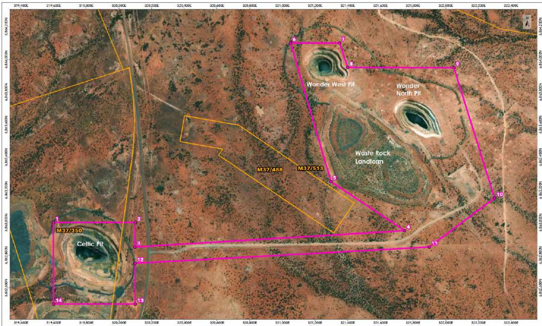
Figure 1: Bundarra General Site Map