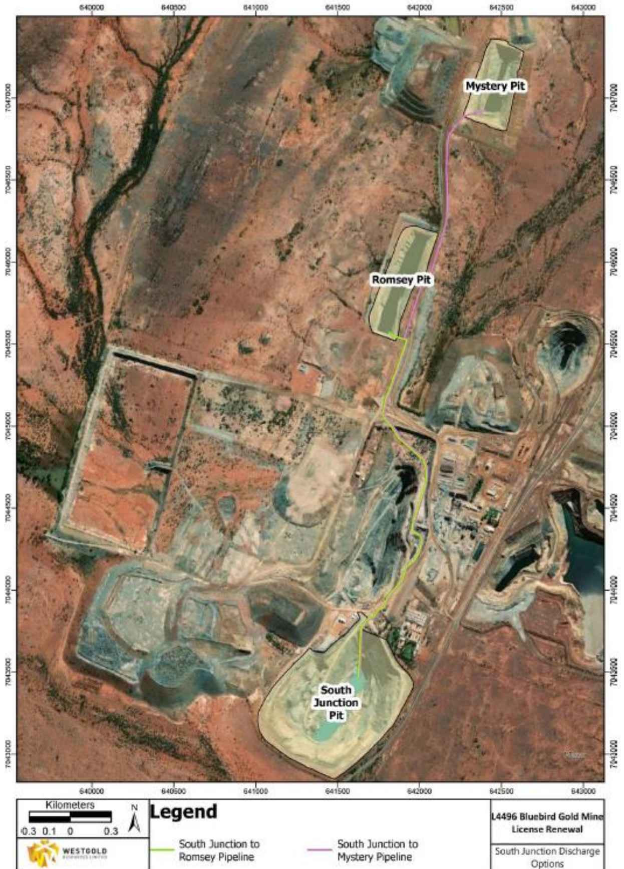
Figure 1: South Junction discharge options