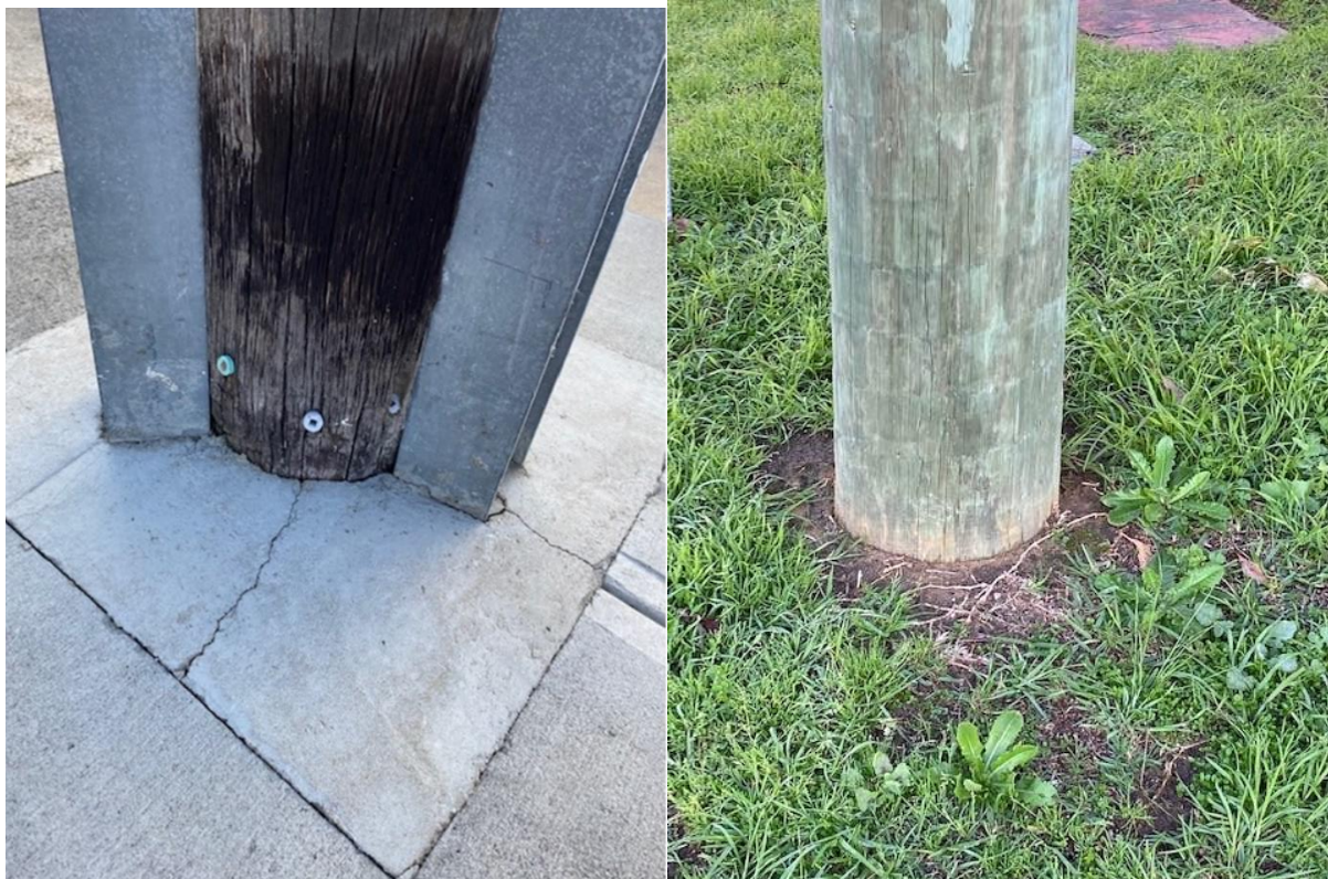
Figure 1: Pole mix coated pole butt containing chemical treatment rods drilled slightly above ground level with metal supports present (left). CCA treated power pole showing distinct green colouring (right).

A summary of the proposed process is provided in Figure 2.