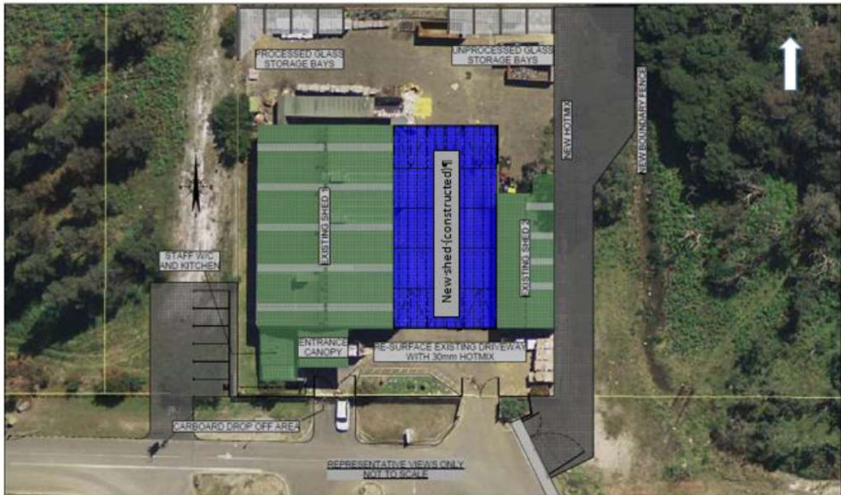
Figure 1: Location map

The Premises location is shown in the Figure below.