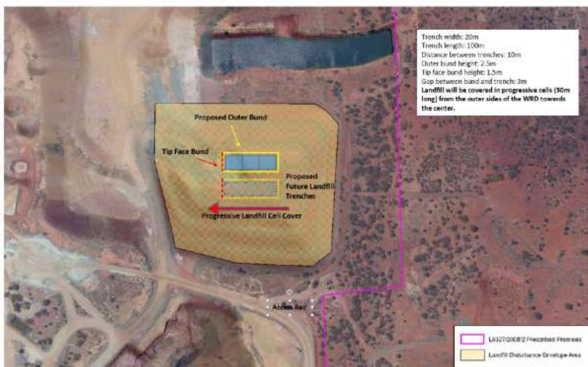
Figure 2: Design of landfill facility