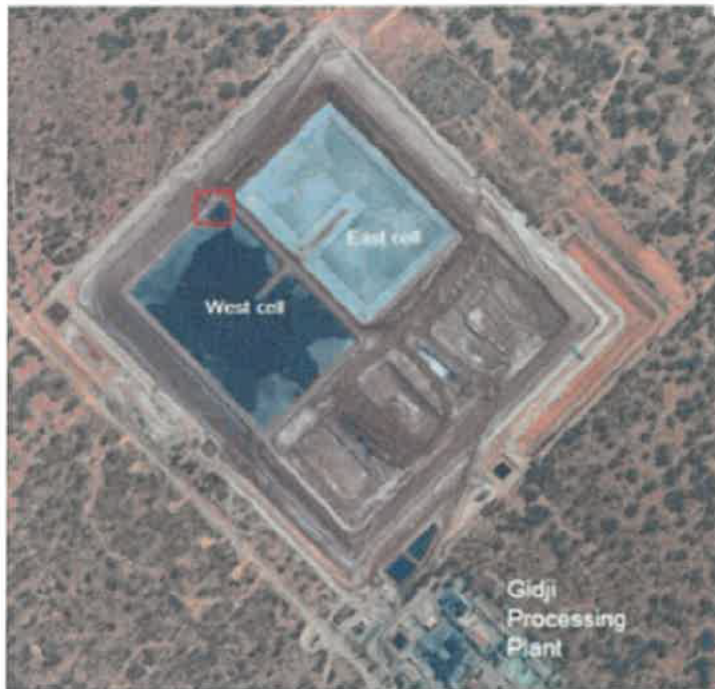
Location and photos of Gidji II TSF West Cell - freeboard breach on north-west wall (outlined in red)