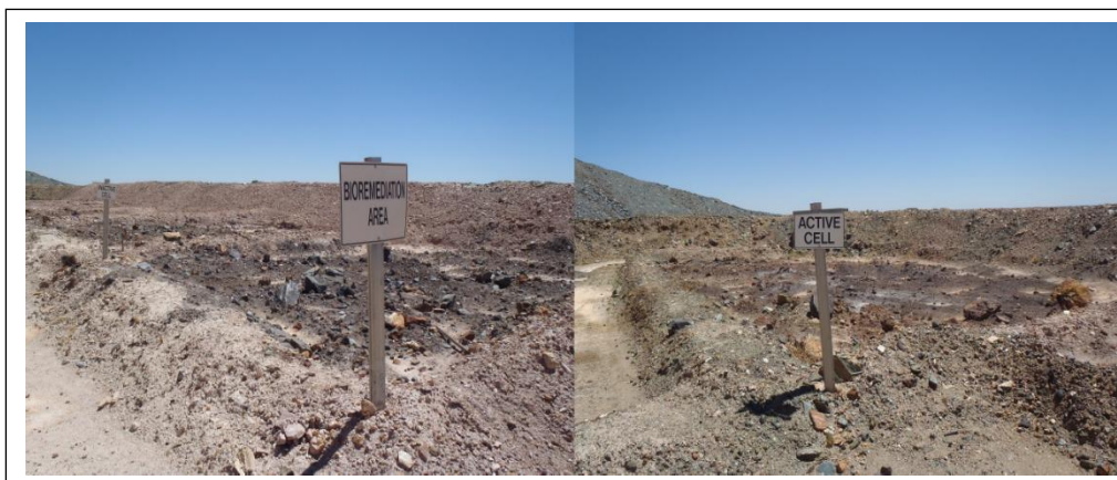
Plate 1: Bioremediation Facility at Jack Hills

The bioremediation facility is managed through a process of periodic tilling of the hydrocarbon material and addition of fertilisers and/or hydrocarbon scavenger. During the reporting period, no hydrocarbon contaminated soil was transported to and deposited in the bioremediation cell as no hydrocarbon spills occurred. The active cell is shown in Plate 1. The facility is currently decommissioned.