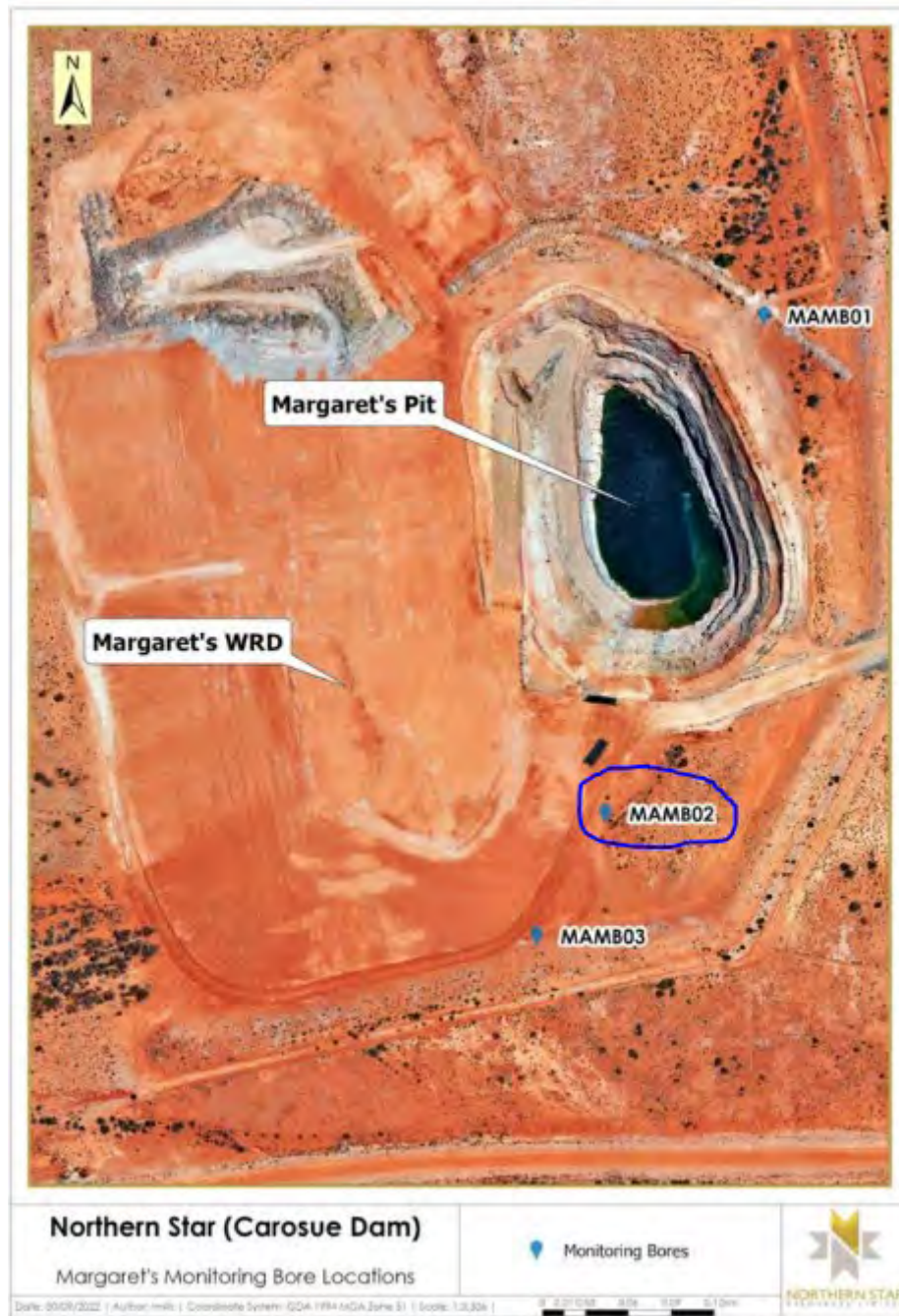
Figure 1: Margarets Monitoring Bores (MAMB02 NC Point circled blue).

Cause (or suspected cause) of non-compliance: