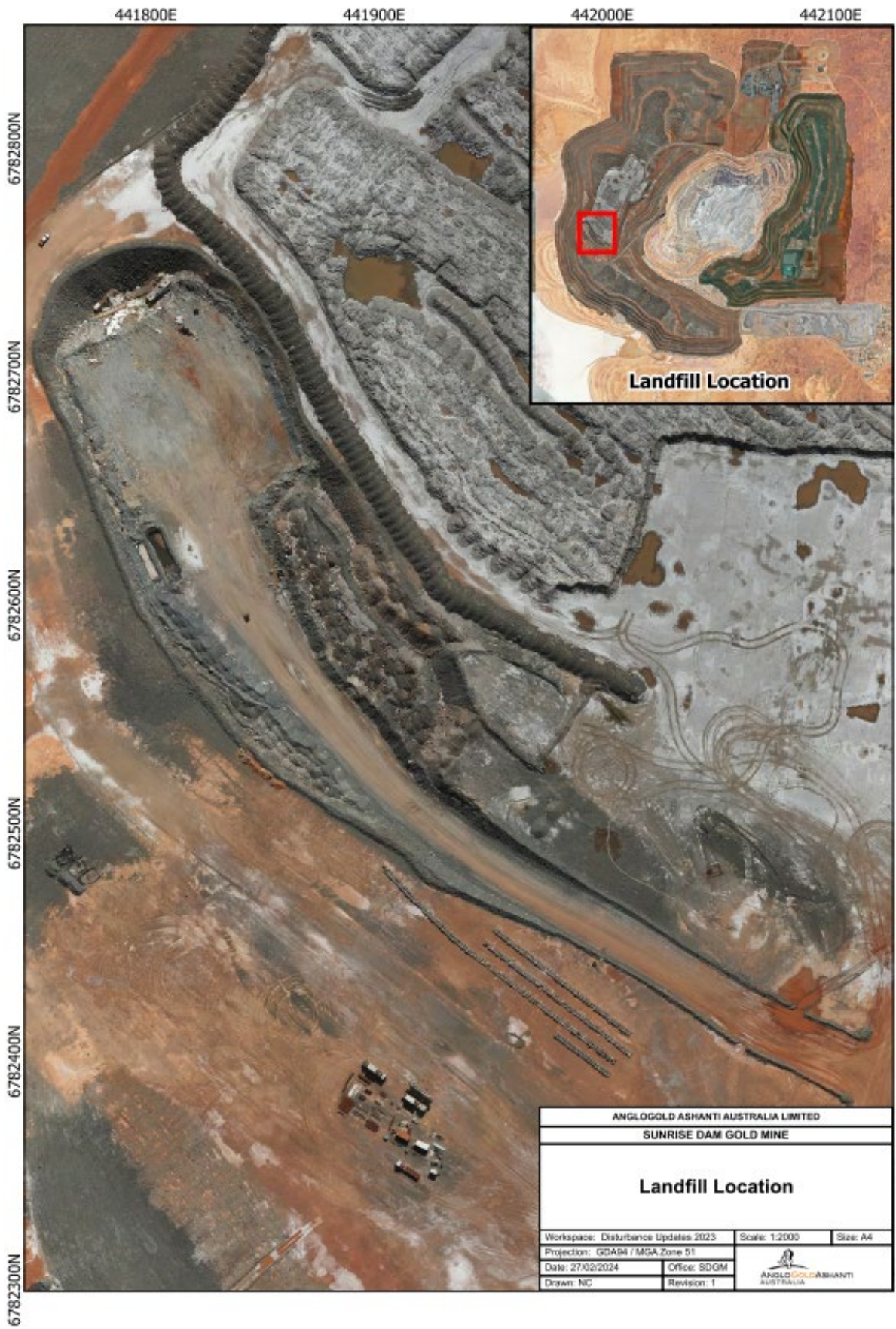
Figure 1 Landfill Location