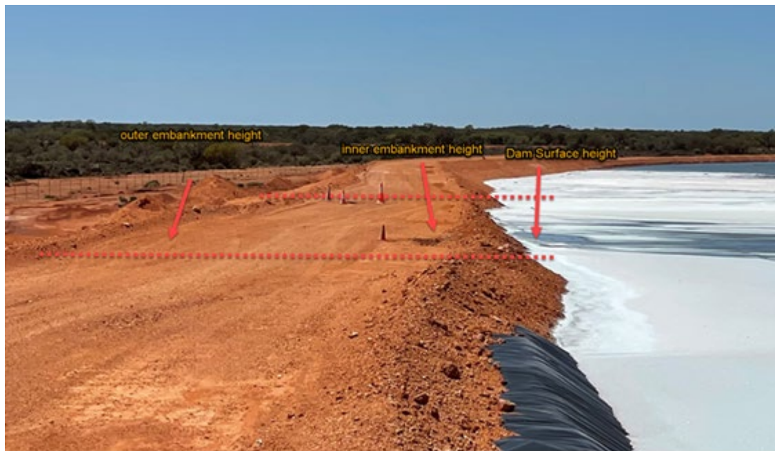
Figure 3: .Embankment height side profile.