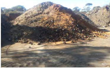
Figure 1, Impacted soil placed into the material handling laydown yard