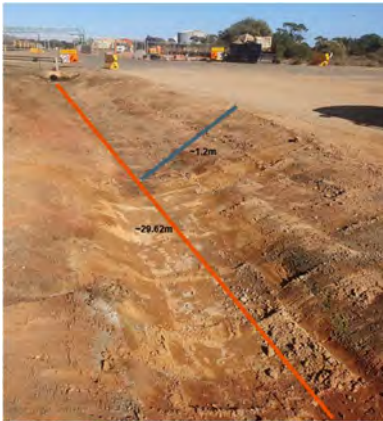
Figure 2, Impacted area post removal

Was this non-compliance previously reported to DWER?