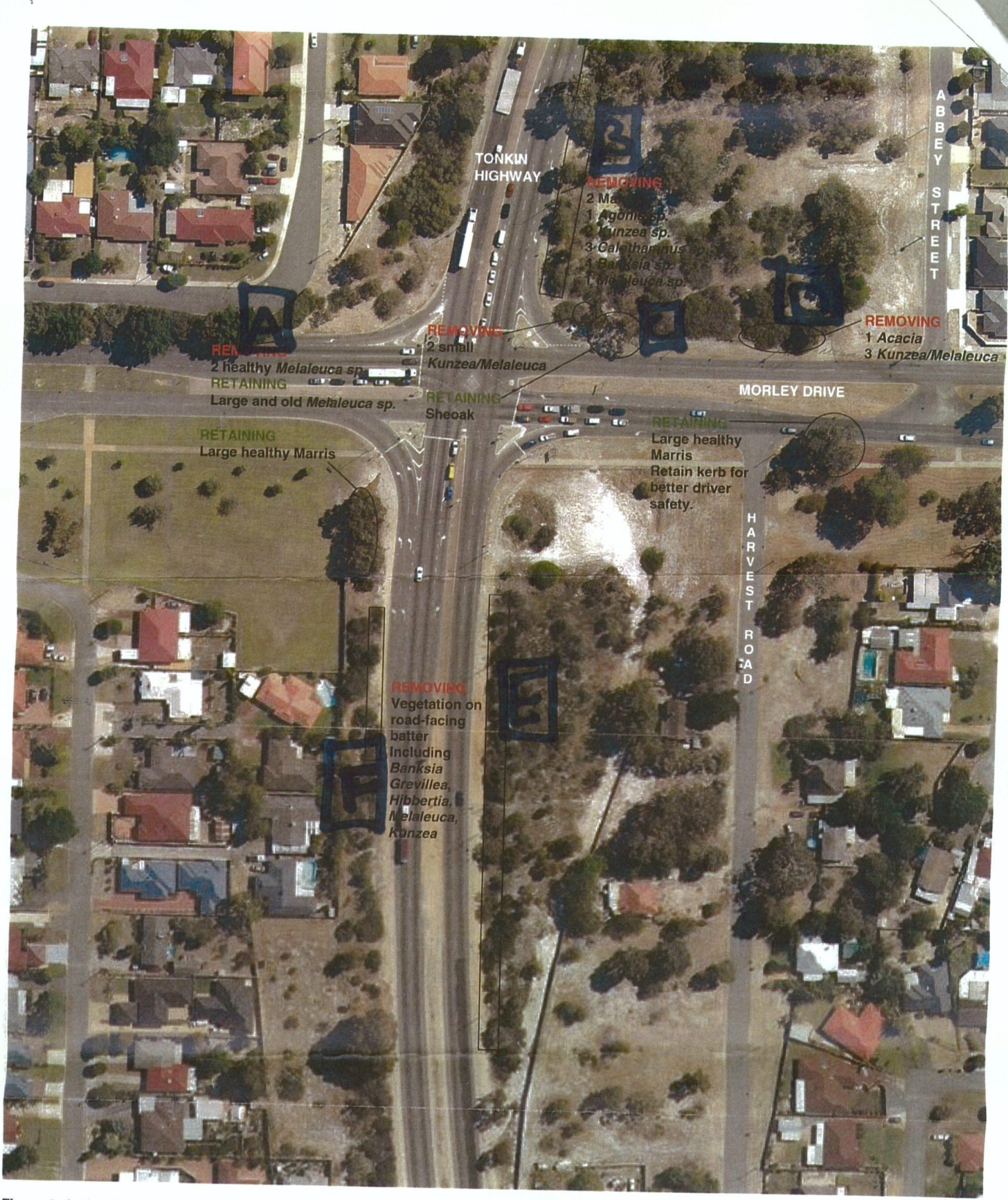
Figure 2 Aerial photograph of project area