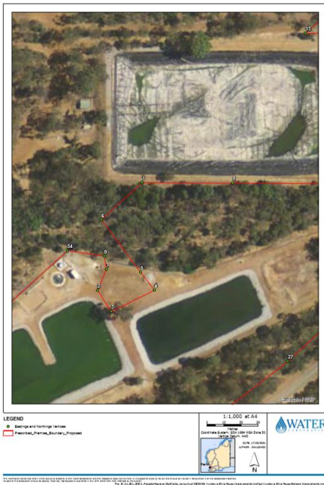
Figure 2: Inset covering the excised area from the prescribed premises.