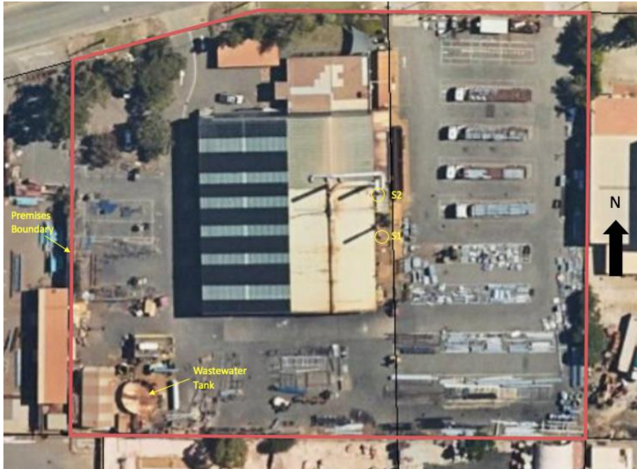
Figure 1: Map of the boundary of the prescribed premises

The boundary of the premises is shown in the map below (Figure 1).