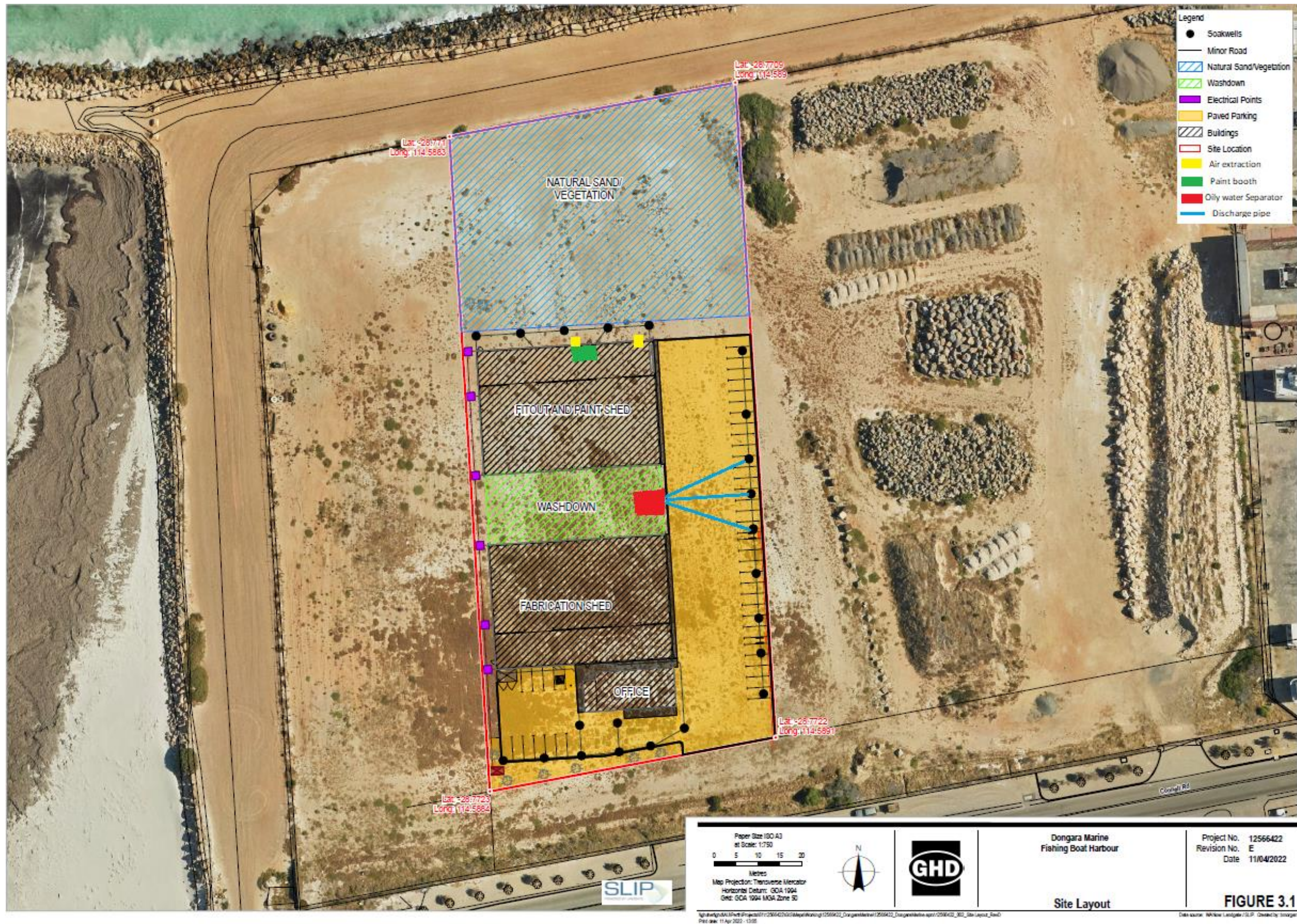
Figure 2: Map showing the layout of the proposed premises

Primary premises infrastructure and its respective location is shown in the map below (Figure 2).