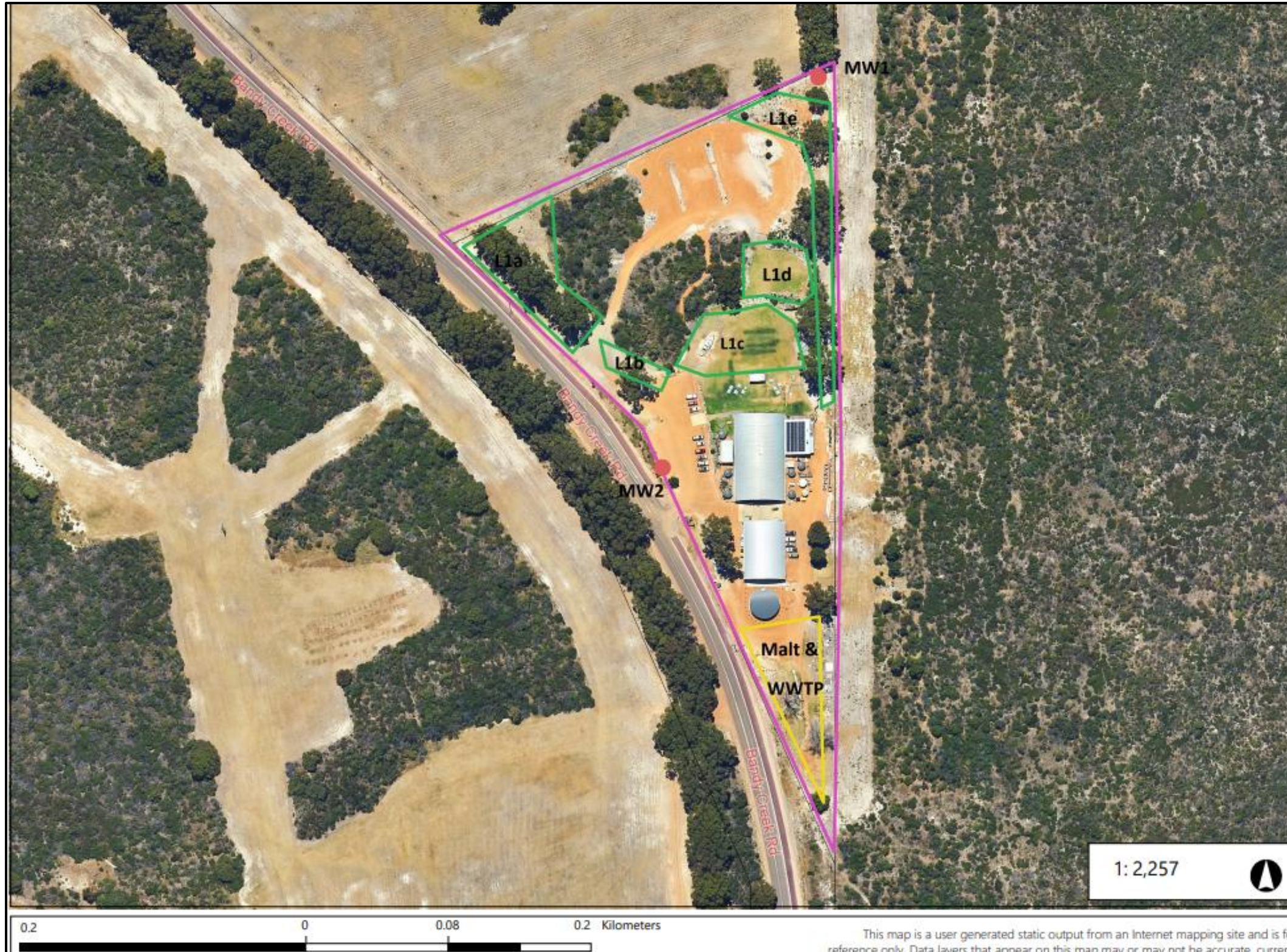
Figure 1: Map of the boundary of the prescribed premises in pink, yellow outline is malt and WWTP facility, green are the irrigation areas, and red dots monitoring well locations.

The boundary of the prescribed premises is shown in the map below (Figure 1).