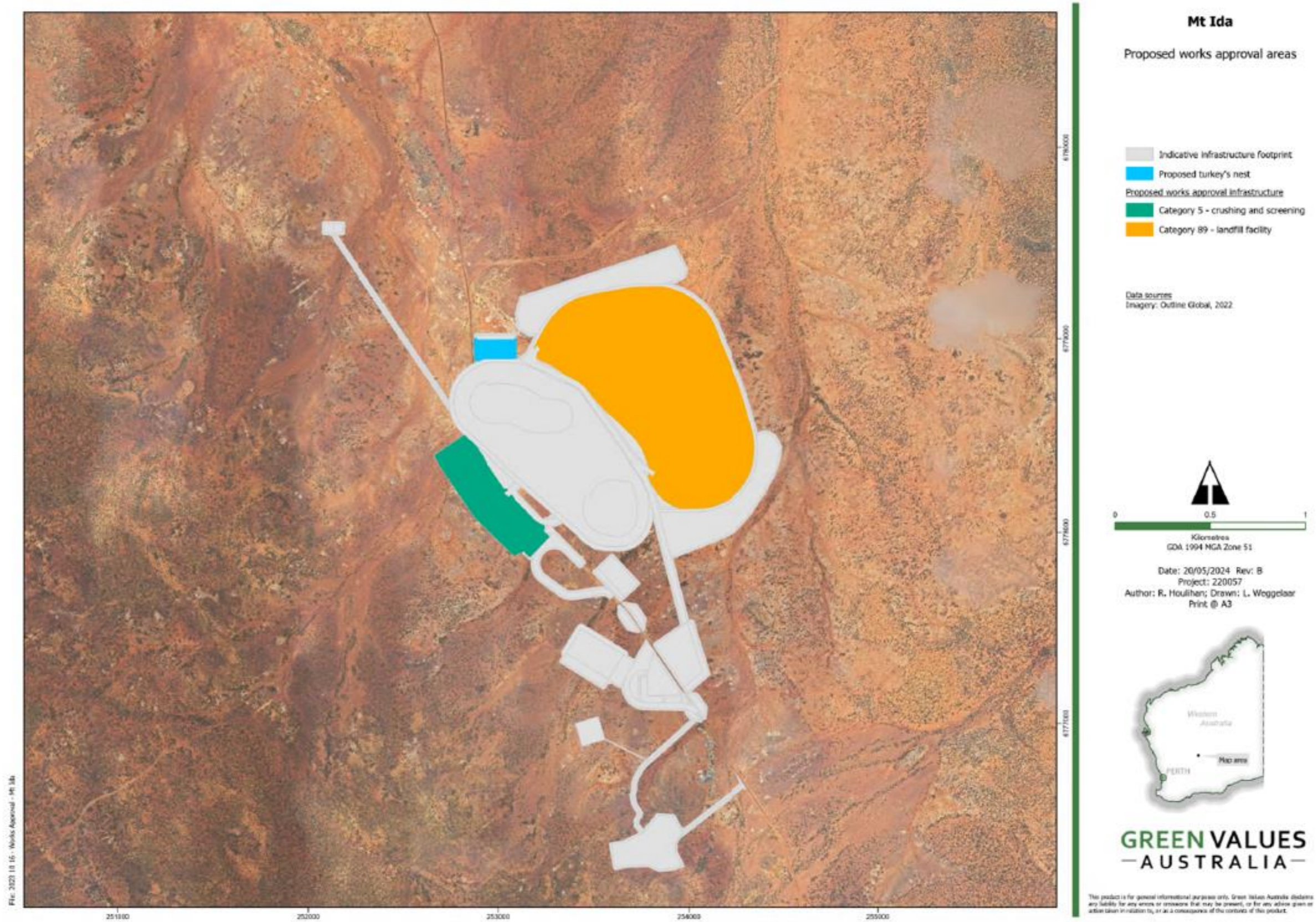
Figure 3: Prescribed activities and location of turkey's nest