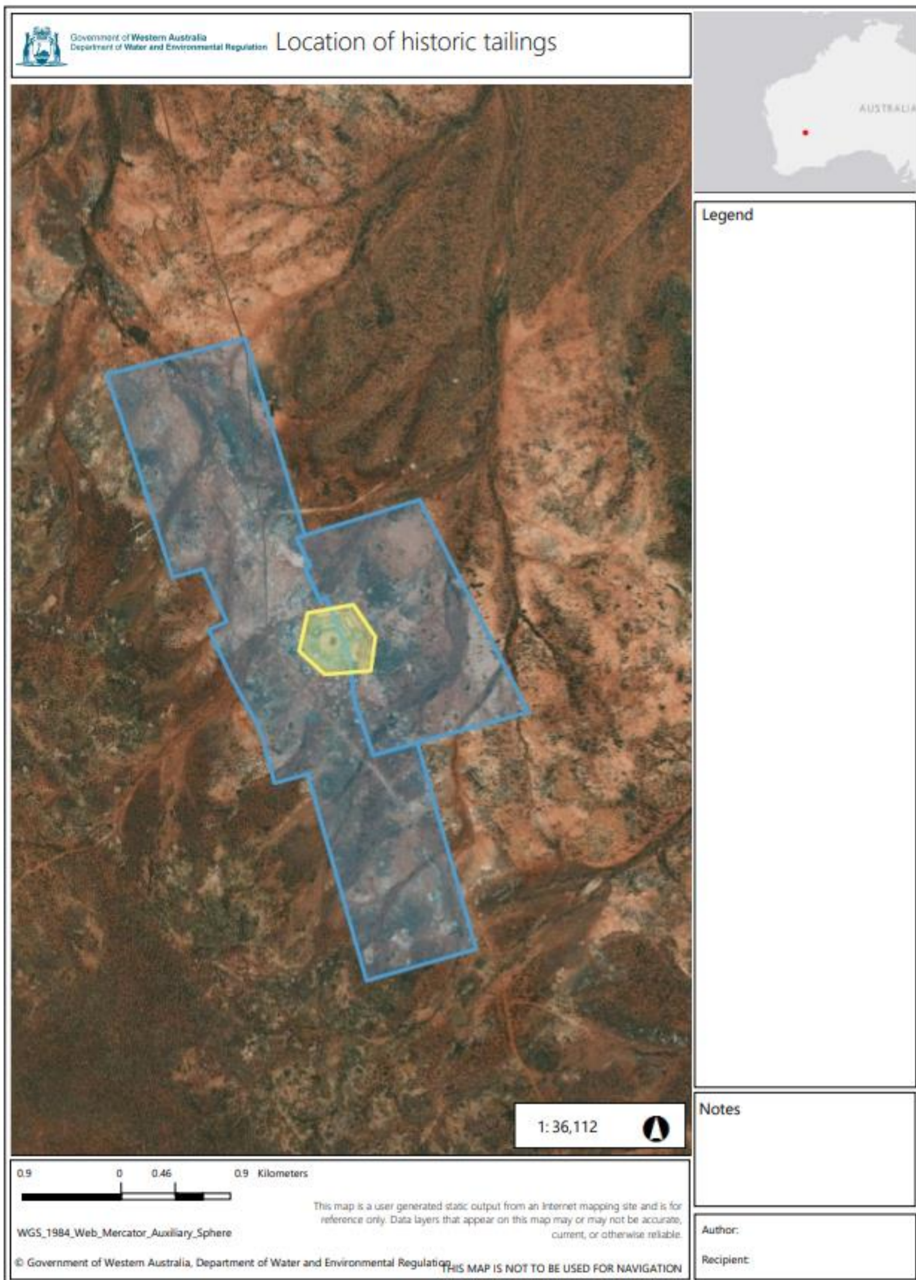
Figure 4 Location of historic tailings within premises boundary