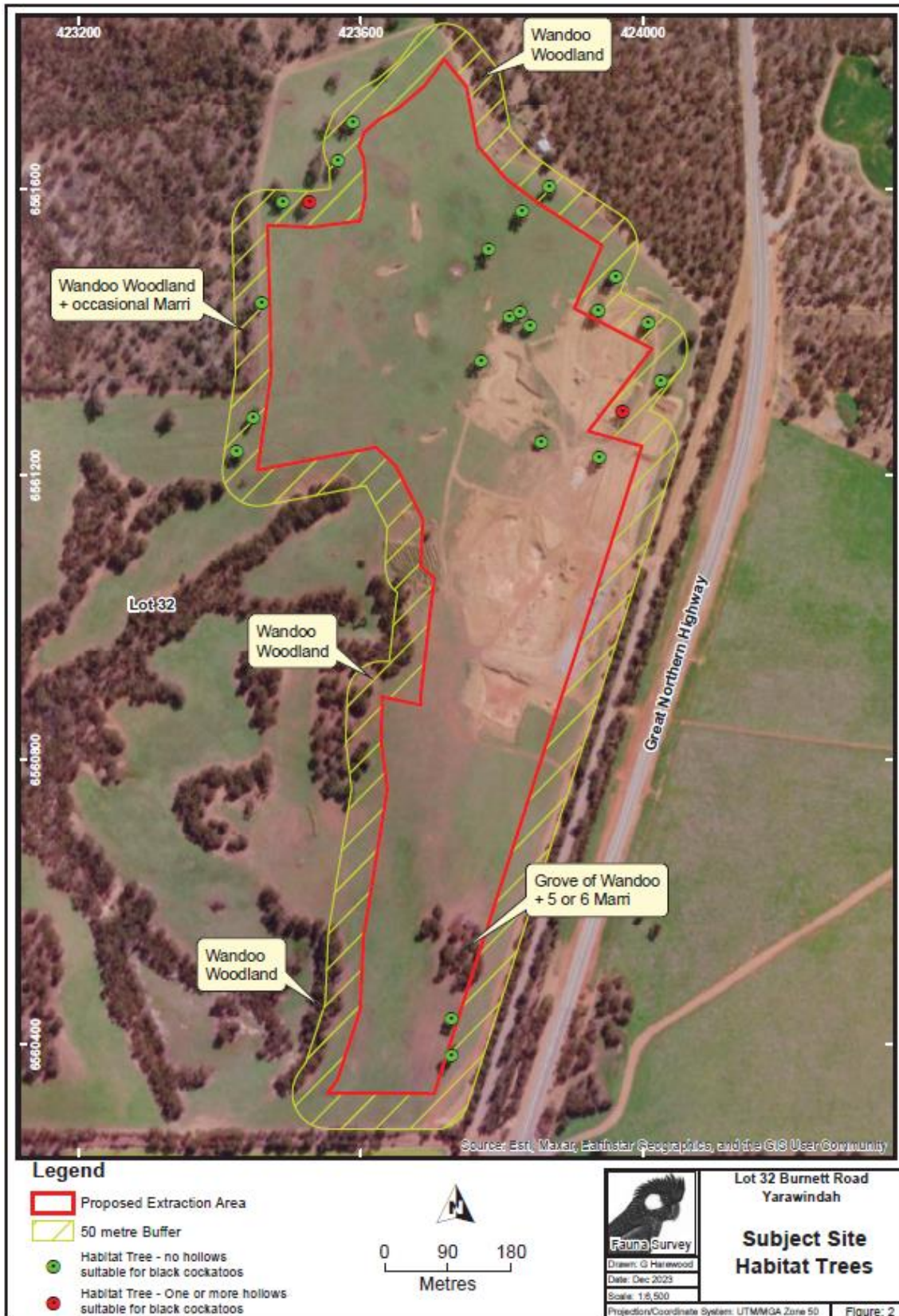
Figure 3: Location of 'Habitat Trees with hollows suitable for black cockatoos' with 50 m exclusion buffer where crushing and screening is not permitted