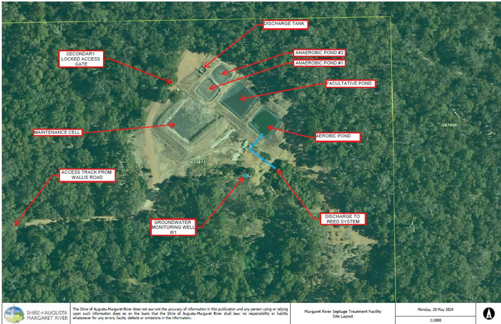
Figure 2: Premises map

L6863/1994/14 - Date of licence issue: 25 July 2024