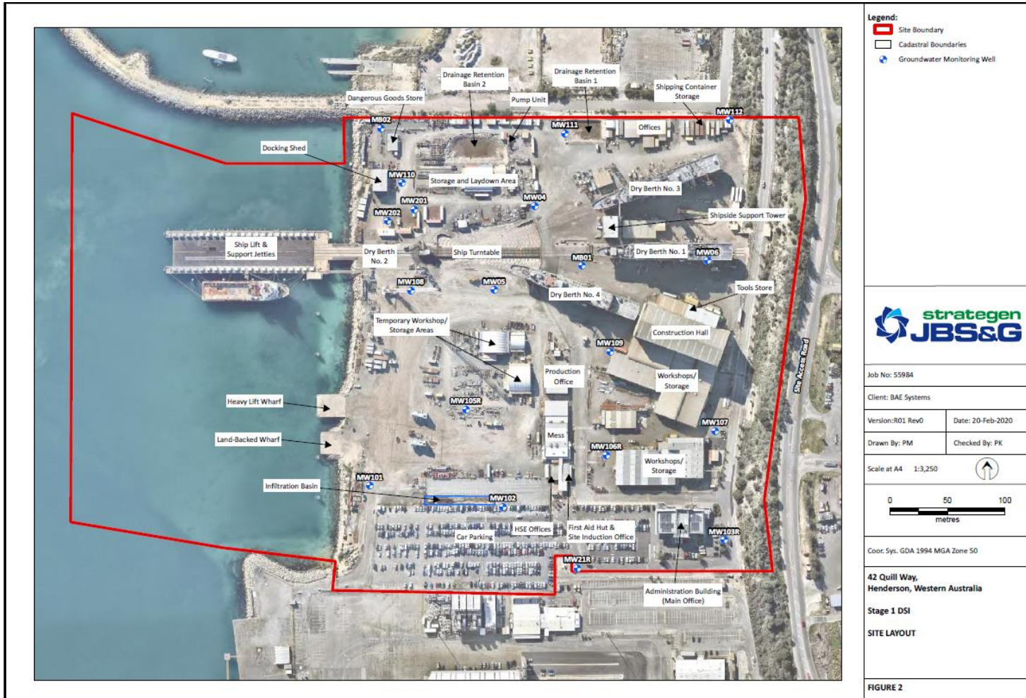
Figure 1: Map of the boundary of the prescribed premises

The boundary of the prescribed premises is shown in the map below (Figure 1).