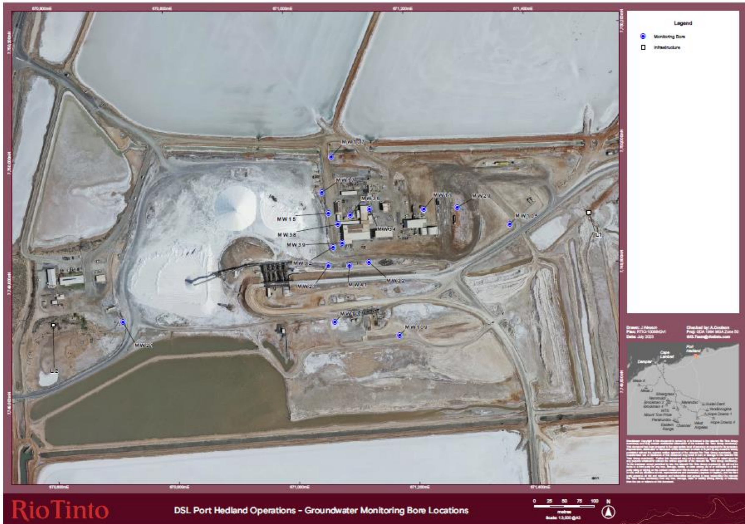
Figure 3: Monitoring locations