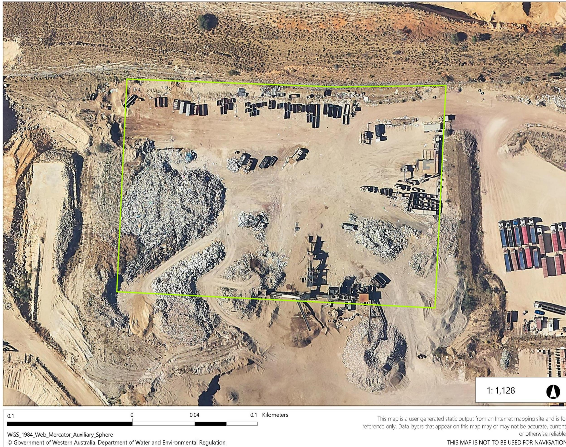
Figure 1: Map of the boundary of the prescribed premises

The boundary of the prescribed premises is shown in the map below (Figure 1).