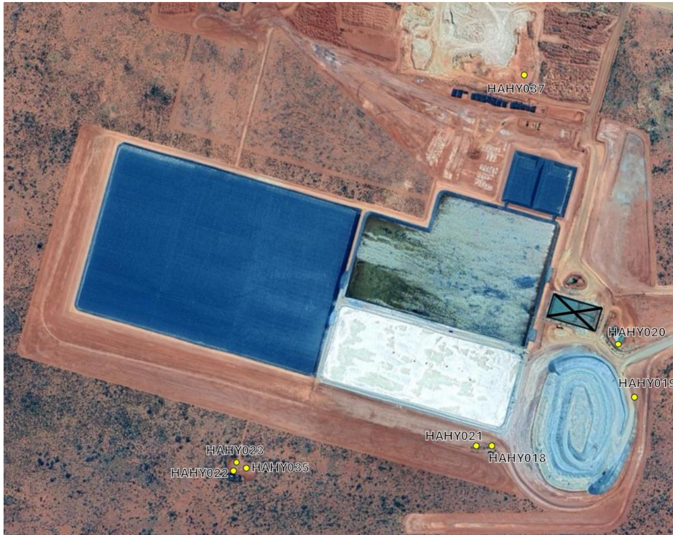
Figure 3: Location of monitoring bores