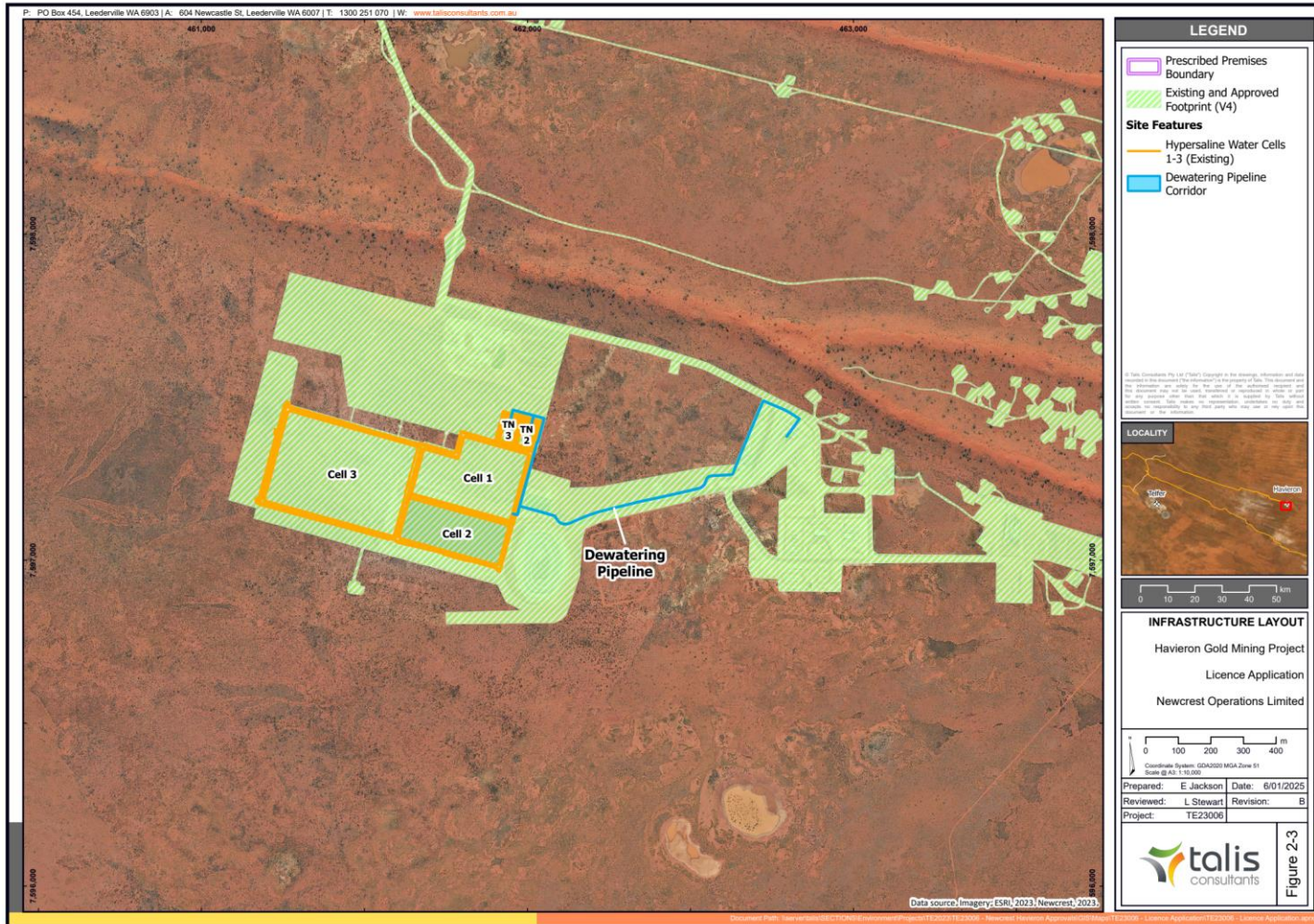
Figure 2: Layout of evaporation ponds and dewatering pipelines