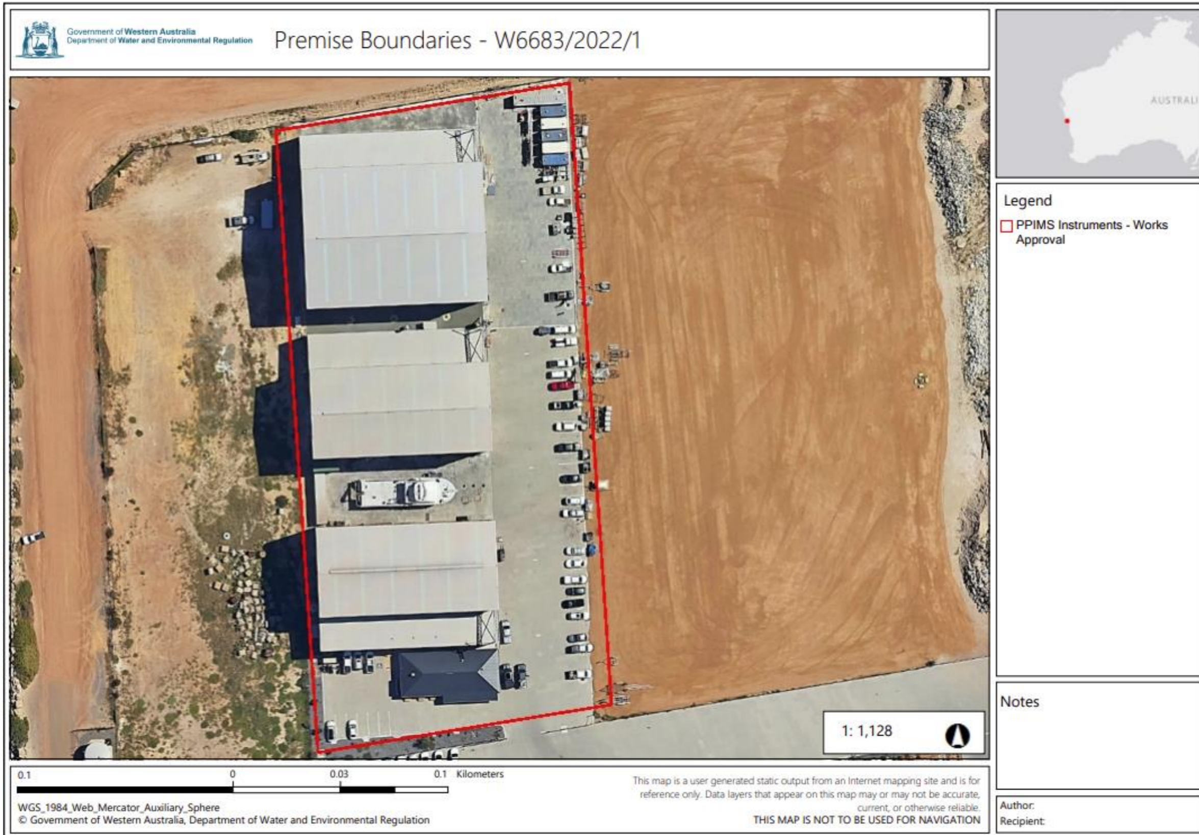
Figure 1: W6683/2022/1 – Premise boundary