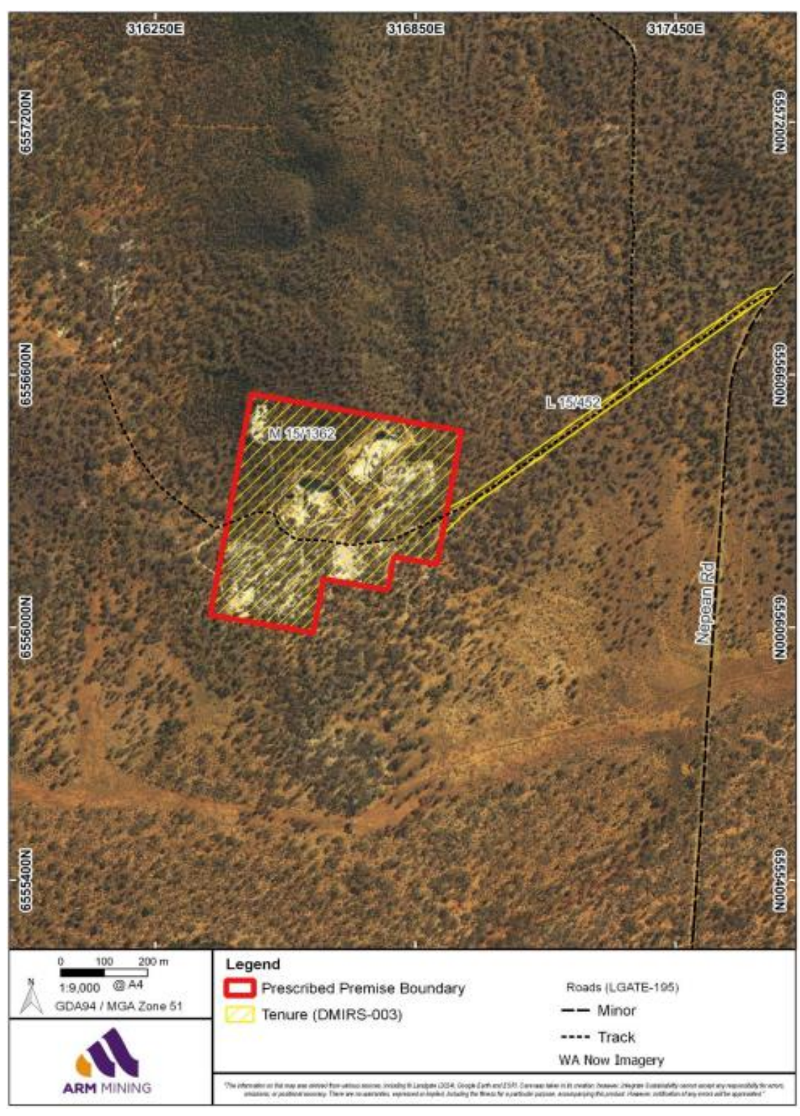
Figure 1: Map of the boundary of the prescribed premises

The boundary of the prescribed premises is shown in the map below (Figure 1).