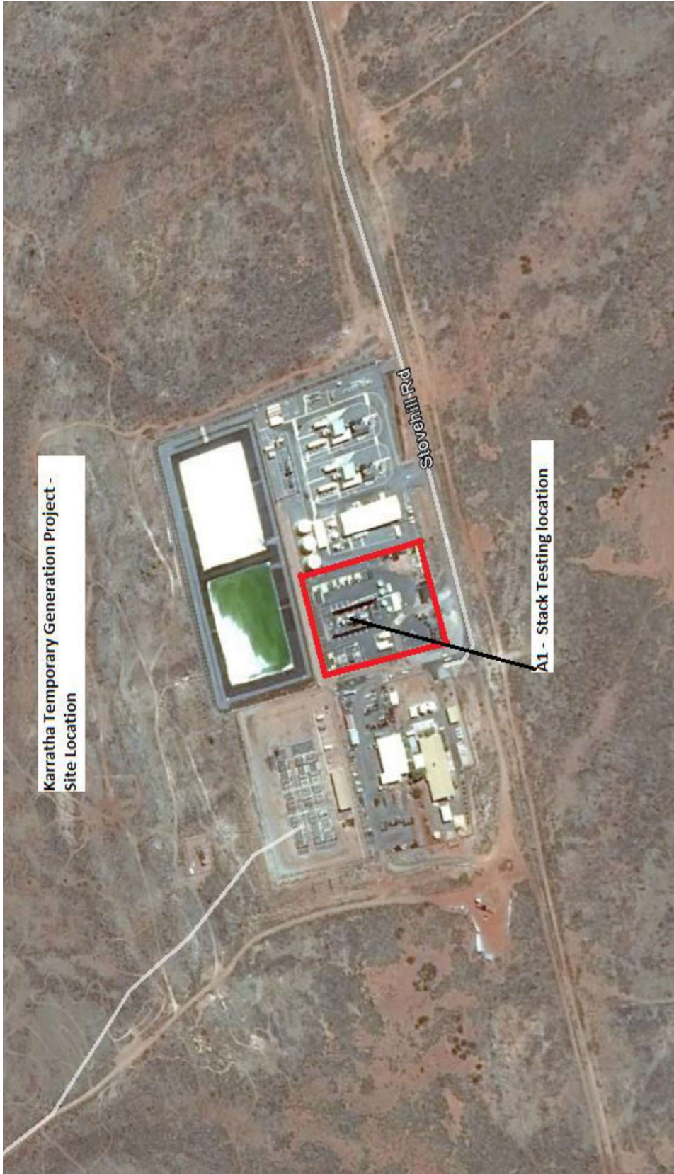
Figure 2: Emission Point A1

The locations of the emission points defined in Tables 1 and 2 are shown below.