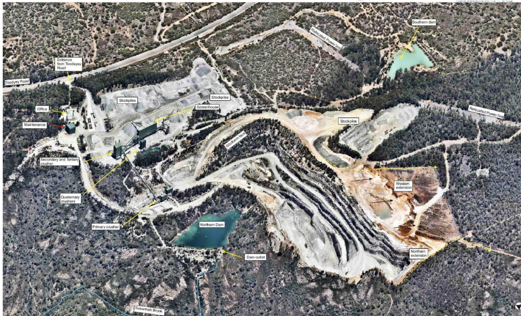
Figure 4: Red Hill Quarry - Prescribed Activities

L4414/1968/12 (amended on 26 August 2025)