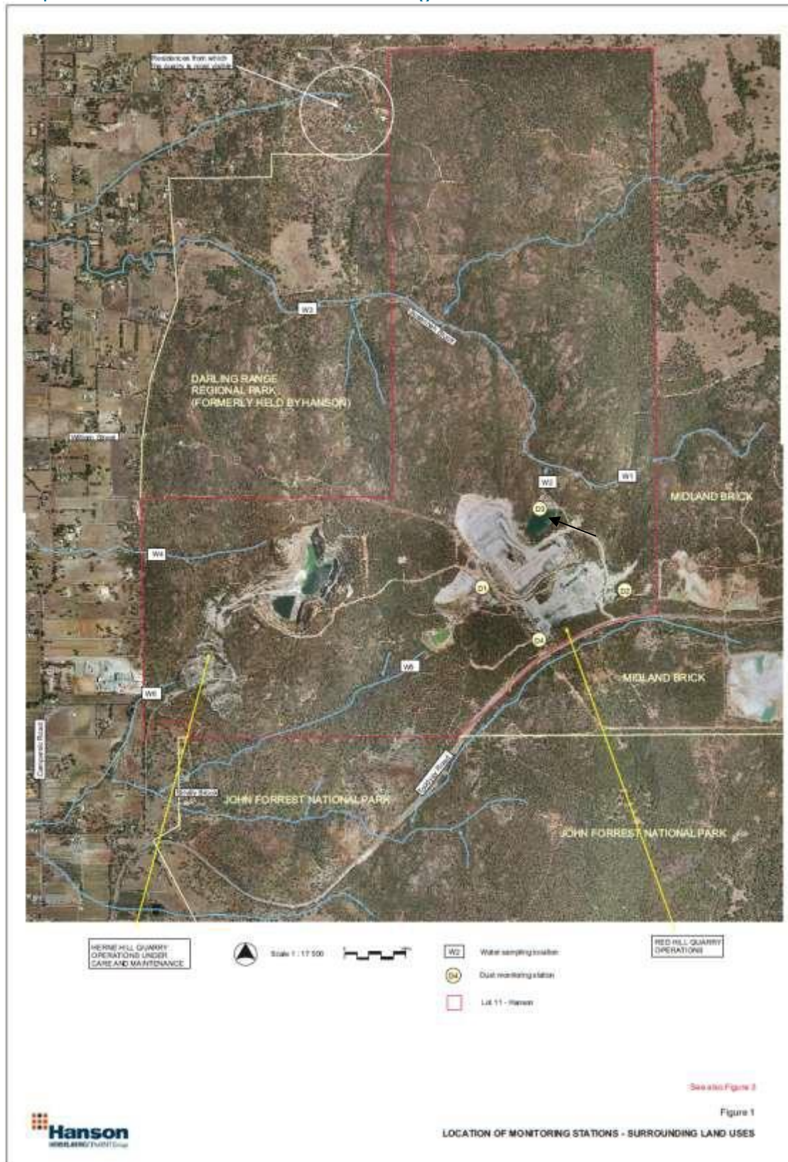
Figure 2: Location of emission and monitoring points