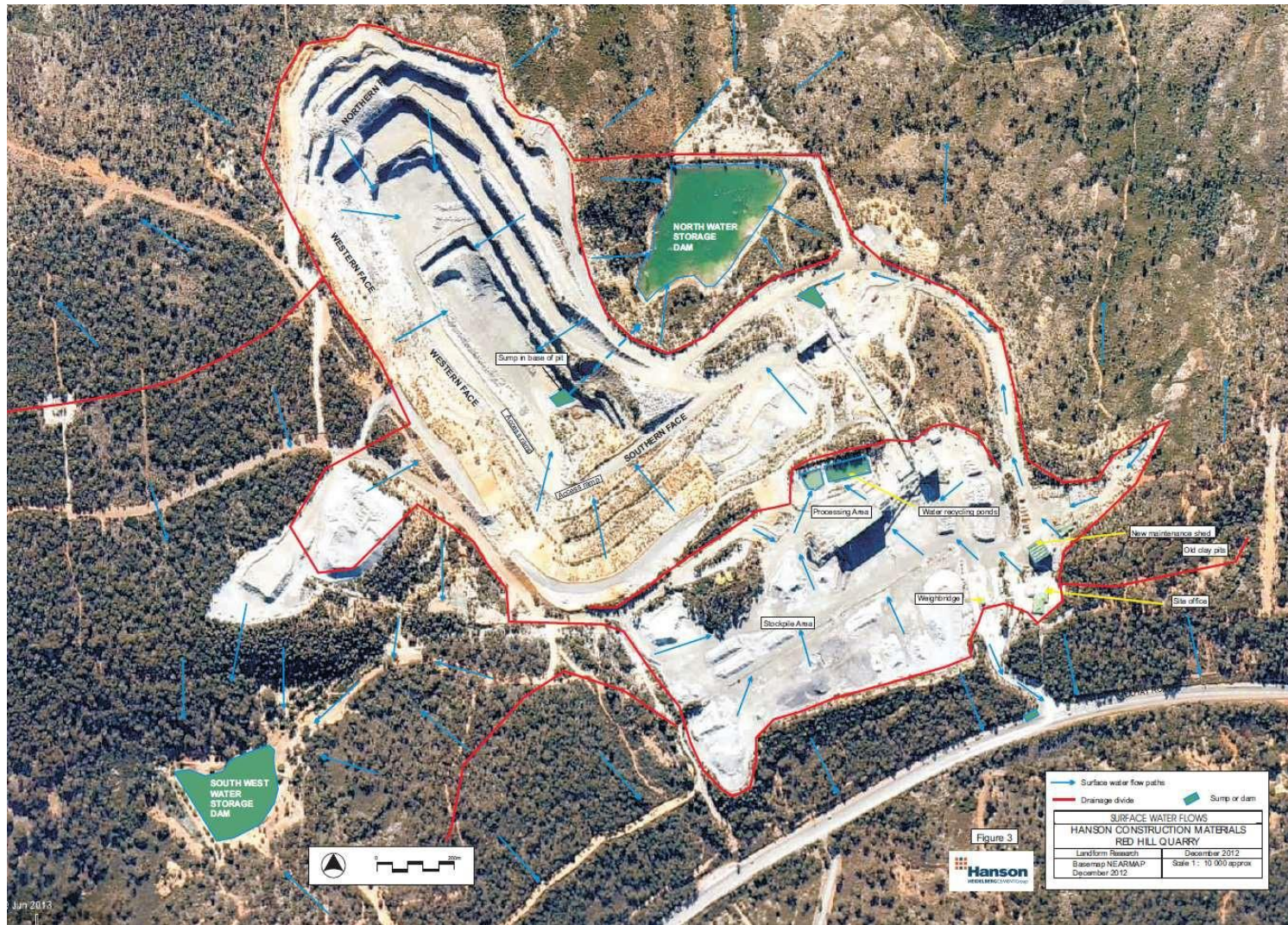
Figure 3: Storage locations

L4414/1968/12 (amended on 26 August 2025)