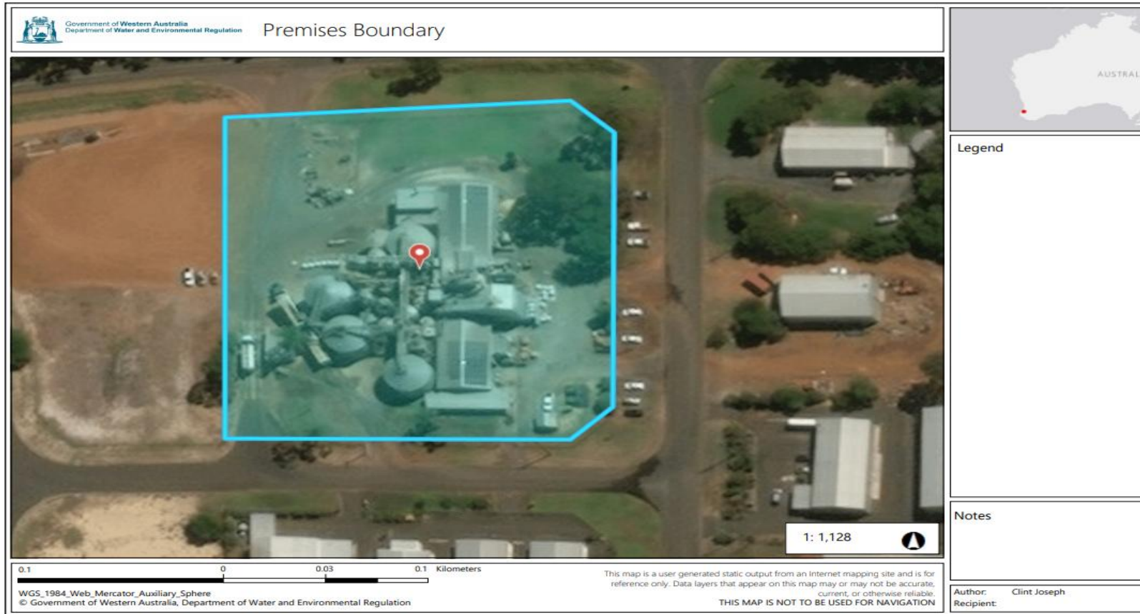
Figure 1: Map of prescribed premises boundary

The blue line depicts the prescribed premise boundary